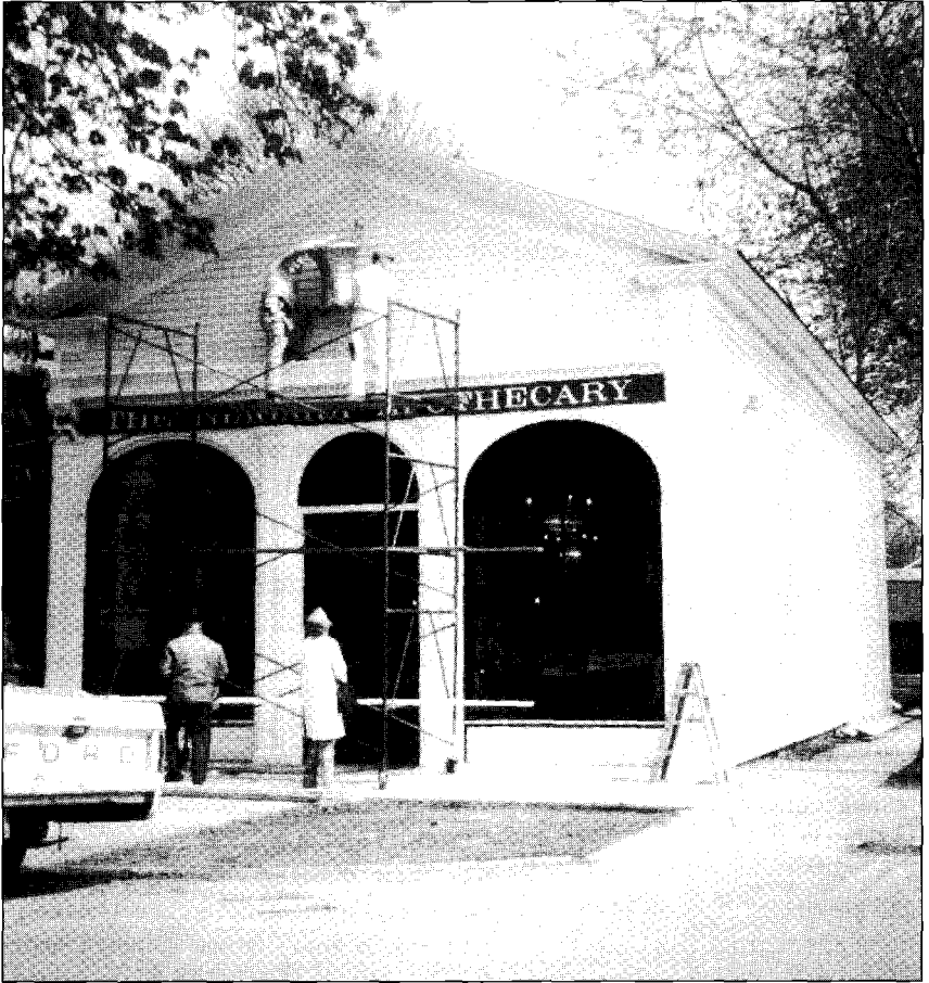
Constructing History: the mortar and pestle are affixed to the pediment, spring 1971.

and capable contractor had to be found, special artisans commissioned, and other workers taught how to do things the old-fashioned way.