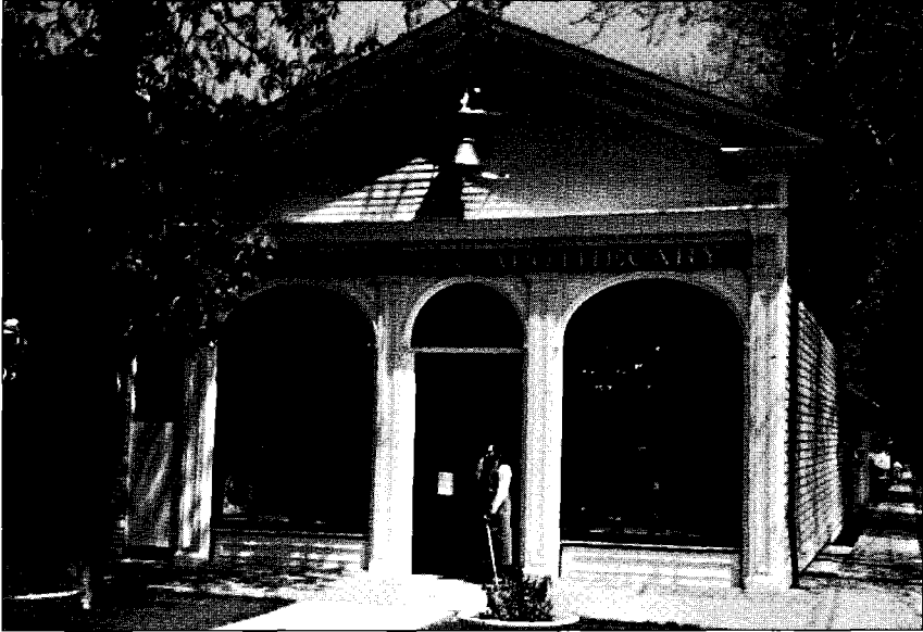
An ideal sight: one of the postcards sold at the apothecary in the 1970s depicts the apothecary's apprentice sweeping the sidewalk. (OHF)

struction. 12 The last few days before the opening were frenzied as pharmacists manoeuvred precious artefacts safely into place while workmen applied finishing touches around them. Flotsam was stuffed into cupboards and the smell of wet paint hung heavily in the air when the doors opened for the big day. Federal and provincial officials arrived. So did local politicians, the architect, and representatives from the College of Pharmacy. A small crowd gathered under sunny skies to hear their speeches. The following day overflow crowds attended a "House Tour and Pharmacy Gala" sponsored by the Niagara Foundation. Field's Drugstore had begun a new life. 13