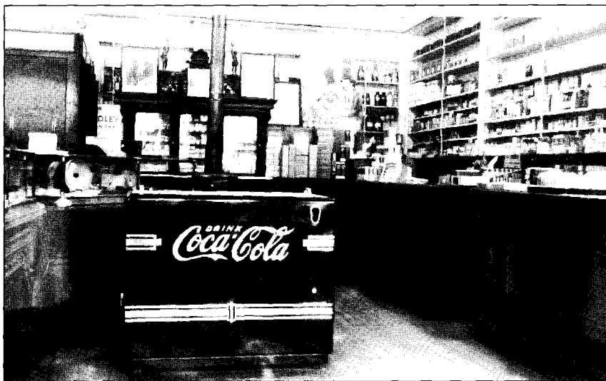
Interior of Field's Drug Store (n.d.), showing signs of the wide variety of products for sale inside. (OHF)

Even residents who did not particularly care for the town's old buildings were conscious that they had economic value. When an upswing in prosperity after the Second World War brought new development pressures into play, the local establishment began looking for ways to protect the traditional character of the town. 2 A Town Planning Board meeting on February 5th, 1962 proposed the creation of a new organisation that could act to preserve local heritage. It took some lobbying at Queen's Park, but the Niagara Foundation was chartered under provincial legislation in 1962. Its first president was the town's mayor. 3