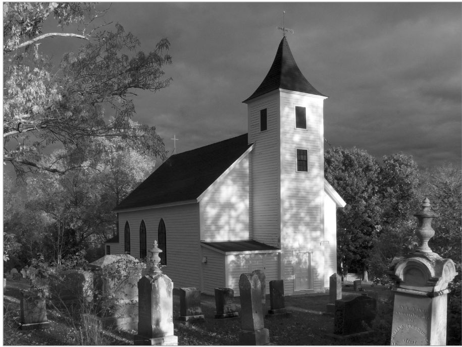
FIG. 5. CHRIST CHURCH, KARSALE, NS, 1791.

in a letter of 1788, stating: "We are all Loyal American Refugees who have been exiled from the Land of our nativity by means of our firm attachment to both Church and State, and have taken refuge in this place which but five years ago was a thicket of uninhabited woods . . . "13