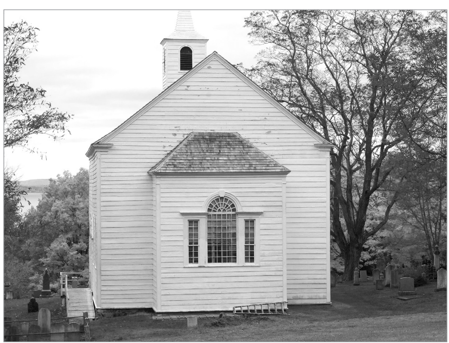
FIG. 7. OLD ST. EDWARD'S, CLEMENTSPORT, NS, 1797.