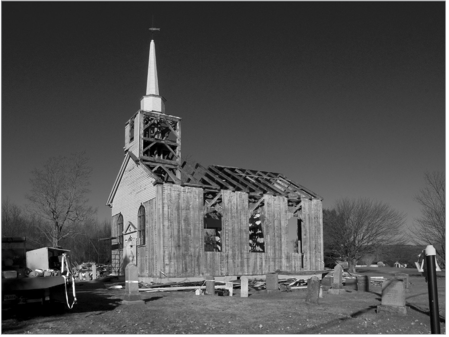
FIG. 12. ALL SAINTS, GRANVILLE CENTRE, IN THE AUTUMN OF 2009. | PETER COFFMAN.

with a large, elevated platform means it will not be visible from the inside of the church.