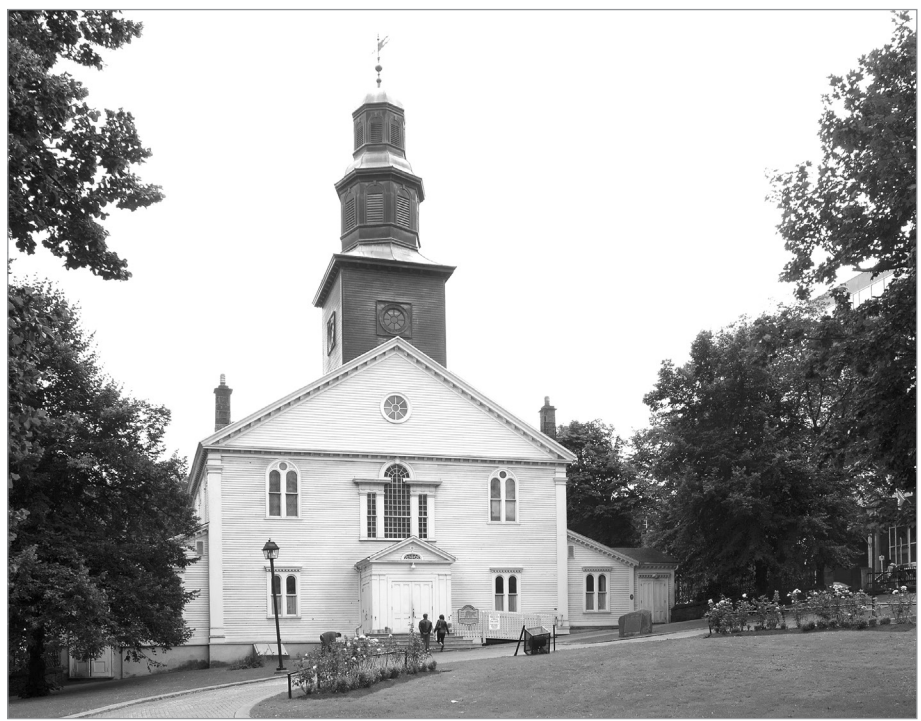
FIG. 3. ST. PAUL'S CHURCH, HALIFAX, NS, BEGUN 1750. | PETER COFFMAN.