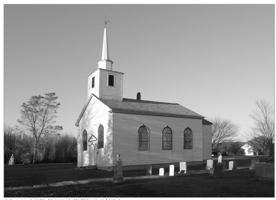
FIG. 1. ALL SAINTS, GRANVILLE CENTRE, NS, IN 2008.

The shifting identities of AII Saints raise some interesting questions. Given its pre-Confederation origins, was it really a "Canadian" church? Is it now an "American" one, simply by virtue of the fact that it is now located in the United States? And how was history used, abused, or ignored when it was sold? In order to explore these questions, a brief outline of the building's history and historical context is in order.