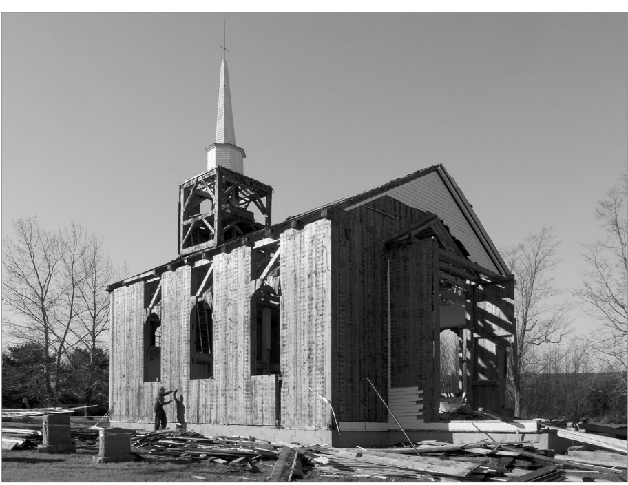
FIG. 9. ALL SAINTS, GRANVILLE CENTRE, NS, DURING DEMOLITION. | PETER COFFMAN.

conventional architecturally-based assessments have been replaced with values-based criteria.