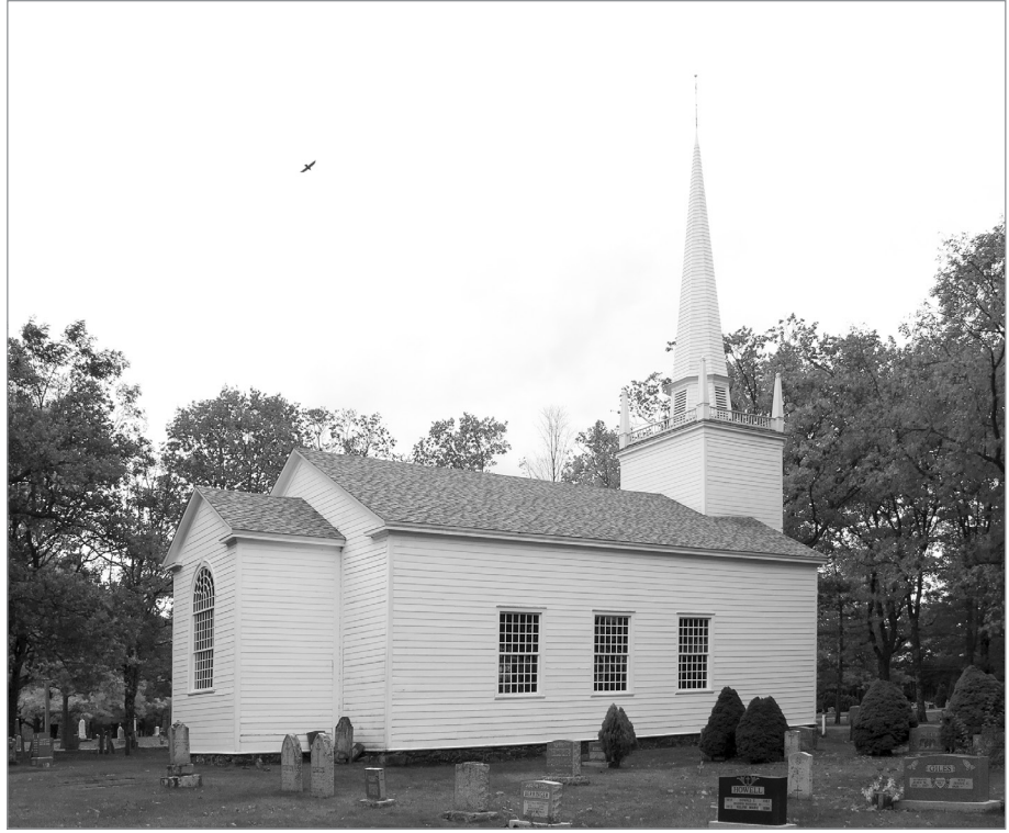
FIG. 6. HOLY TRINITY, MIDDLETON, NS, 1791.

While there can be no doubt of the pastor's enthusiasm for his new acquisition, his historical references raise some complex issues. The question of where the authority to assign meaning to a historic building lies has been contested in recent years. Increasingly, the constructed and contingent nature of heritage value has been recognized, and more emphasis has been placed on the role of the community in constructing meaning.<sup>19</sup> In particular, the traditional authority of the architectural historian has been challenged, and