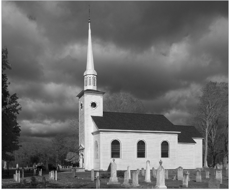
FIG. 4. ST. MARY'S CHURCH, AUBURN, NS, 1790. | PETER COFFMAN.