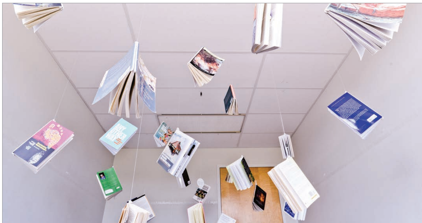
FIG. 6. "WHAT BINDS US" INSTALLATION IN DAYLIGHT.

faculty was overwhelming. We received emails, Facebook messages, and were stopped in the hallways of Waterloo Architecture by professors and school-mates who made comments such as the following: