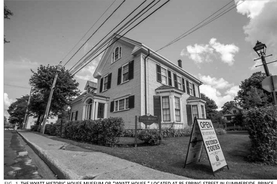
FIG. 1. THE WYATT HISTORIC HOUSE MUSEUM OR "WYATT HOUSE," LOCATED AT 85 SPRING STREET IN SUMMERSIDE, PRINCE EDWARD ISLAND.

This essay argues that historic house museums can be reconceptualized to serve as effective sites of narration for important and seldom acknowledged women's histories. Despite the nineteenth and early-twentieth centuries correlation between women and domestic spaces, many Canadian house museums were created to preserve the histories of prominent male figures from our past. I argue that the Wyatt Historic House Museum operates outside of that model and is a unique example of a house museum that highlights diverse women's