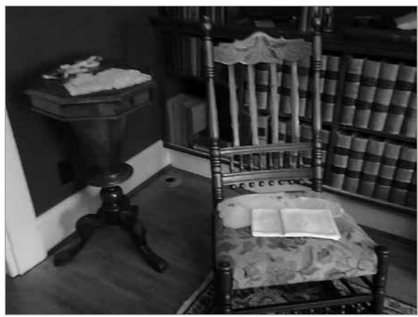
FIG. 6. ROCKING CHAIR AND SEWING TABLE IN NED'S STUDY. | ADAM KIRKEY, 2014.