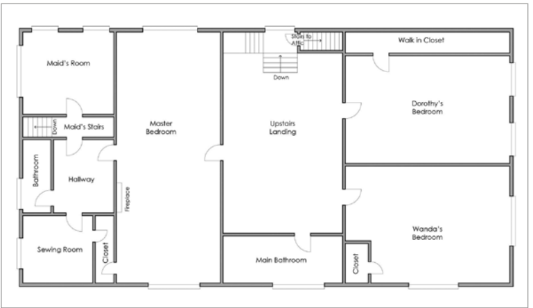
FIG. 7. FLOOR PLAN OF THE SECOND FLOOR OF THE WYATT HISTORIC HOUSE MUSEUM (NOTE: PLAN IS NOT TO SCALE). | Jessica Kirkham.