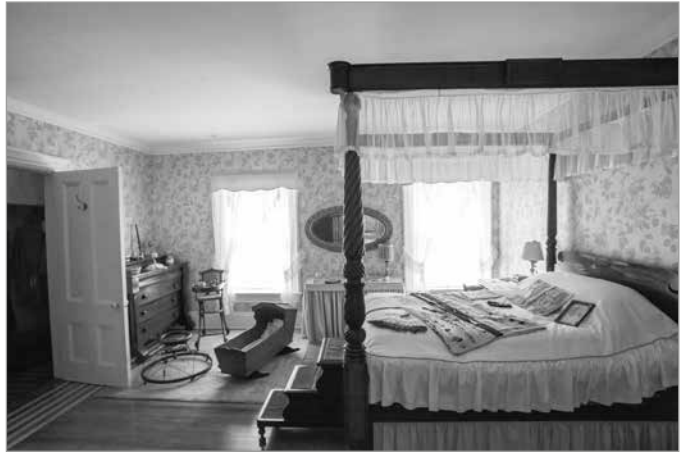
FIG. 8. DOROTHY WYATT'S BEDROOM FEATURING WALK-IN CLOSET, FOUR-POSTER BED, AND NURSERY FURNITURE. | ADAM KIRKEY, 2014.