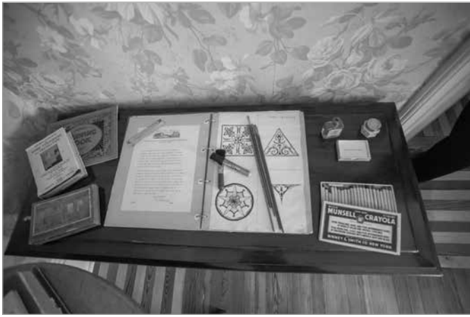
FIG. 9. A SELECTION OF DOROTHY WYATT'S ART SUPPLIES ON DISPLAY IN HER BEDROOM. | ADAM KIRKEY, 2014.

used to contest previously held assumptions about separate sphere ideologies.