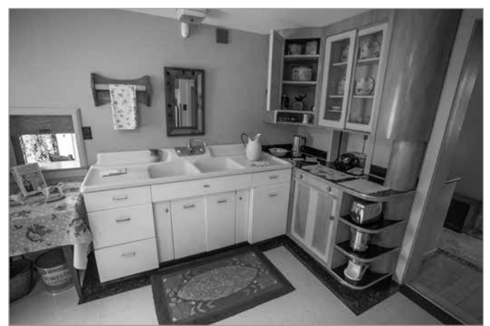
FIG. 12. A CORNER OF THE KITCHEN IN THE WYATT HISTORIC HOUSE MUSEUM, FEATURING THEIR KITCHEN QUEEN SINK. | ADAM KIRKEY, 2014.