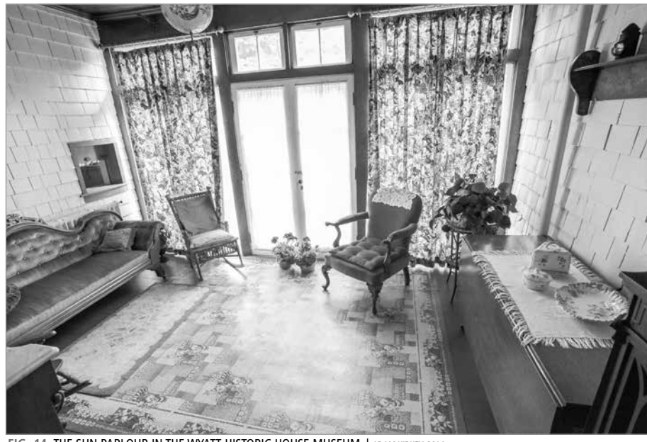
FIG. 14. THE SUN PARLOUR IN THE WYATT HISTORIC HOUSE MUSEUM.