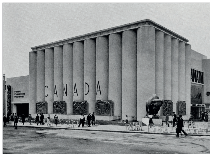
FIG. 6. CANADIAN PAVILION, 1937 WORLD'S FAIR, PARIS, FRANCE. | ÉMILE BRUNET. FROM JOURNAL, ROYAL ARCHITECTURAL INSTITUTE OF CANADA , VOL. 14, NO. 10, OCTOBER 1937, P. 203.

a comparatively few individuals seem to be given to religion, some form other than the Gothic cathedral must be found. Industry concerns the greatest numbers—it may be true, as has been said, that our factories are our substitute for religious expression. 15