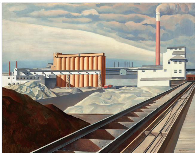
FIG. 5. CHARLES SHEELER, CLASSIC LANDSCAPE , 1931, OIL ON CANVAS, 63.5 X 81.9 CM. | BARNEY A. EBSWORTH COLLECTION, NATIONAL GALLERY OF ART, WASHINGTON, DC.