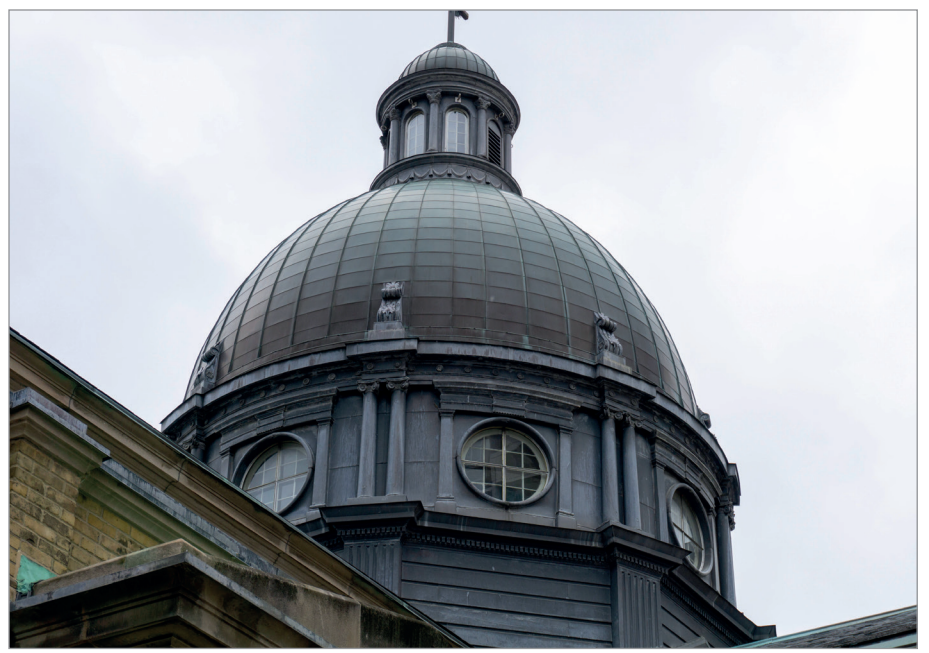
FIG. 11. DOME, OUR LADY OF LOURDES, TORONTO, ON. | EVAN MCMURTRY.

punctuated by round-headed windows. Unlike at St. Peter's Basilica, they are not paired but equidistant from each other. A feature that has its source in Roman Renaissance architecture is the square window in the centre featuring a broken pediment above with an inverted shell decoration, which is framed by pilaster jambs and a decorative console supporting the sill at each end.