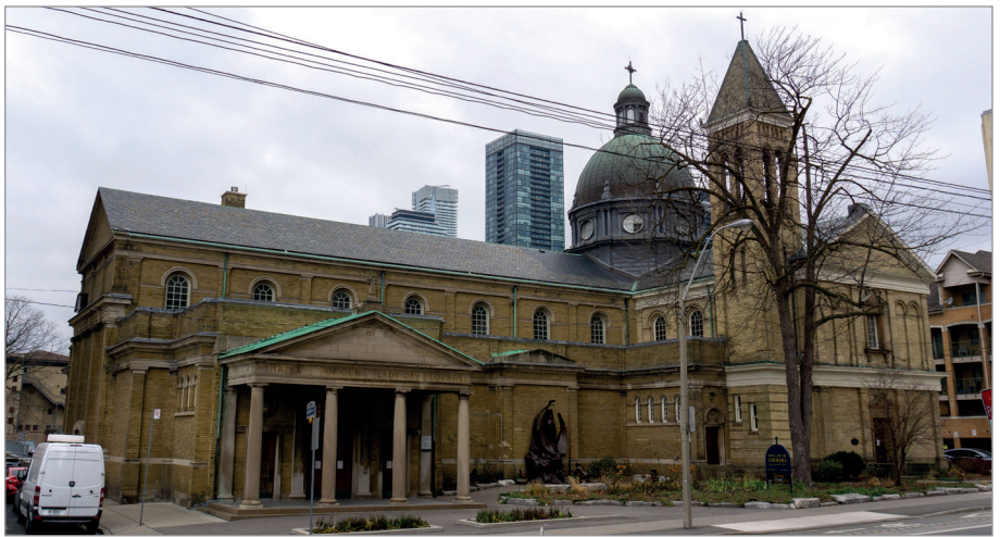
FIG. 9. ST. NINIAN'S CATHEDRAL, ANTIGONISH, NS.