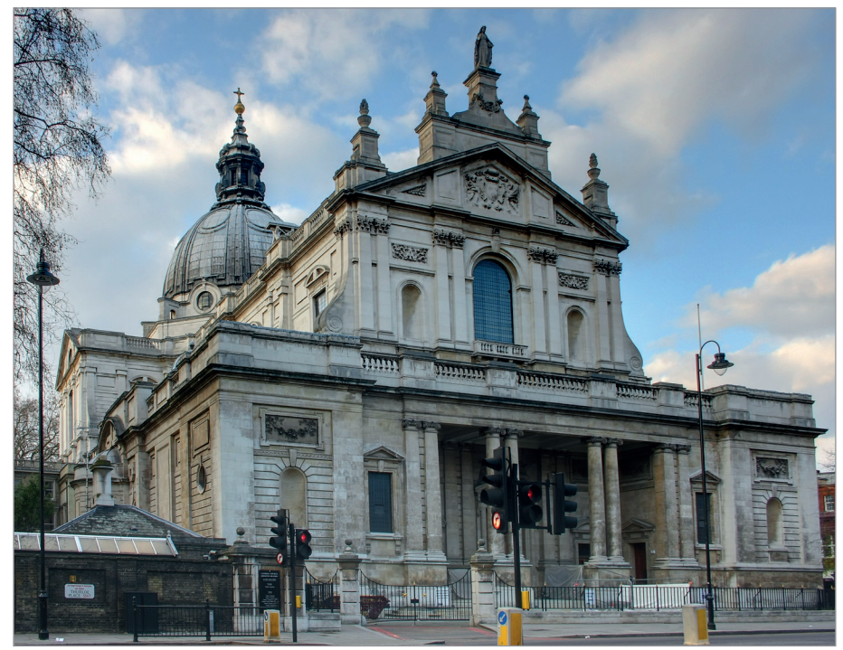
FIG. 4. BROMPTON ORATORY, BROMPTON ROAD, LONDON.

It covered the garden in rear of the University House; a plain brick hall with an apsidal end, timber ceiling etc. somewhat in the manner of the earlier Roman basilicas. He [Newman] felt a strong attachment to those ancient churches with rude exteriors but solemn and impressive within, recalling the early history of the Church, as it gradually felt its way in the converted Empire, and took possession.<sup>23</sup>