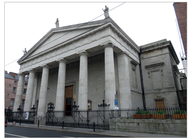
FIG. 7. PRO-CATHEDRAL, DUBLIN.