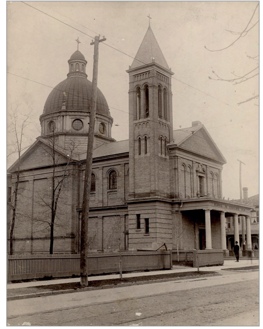
FIG. 3. OUR LADY OF LOURDES, TORONTO, ON, C. 1894.

has been the subject of very little secondary literature.