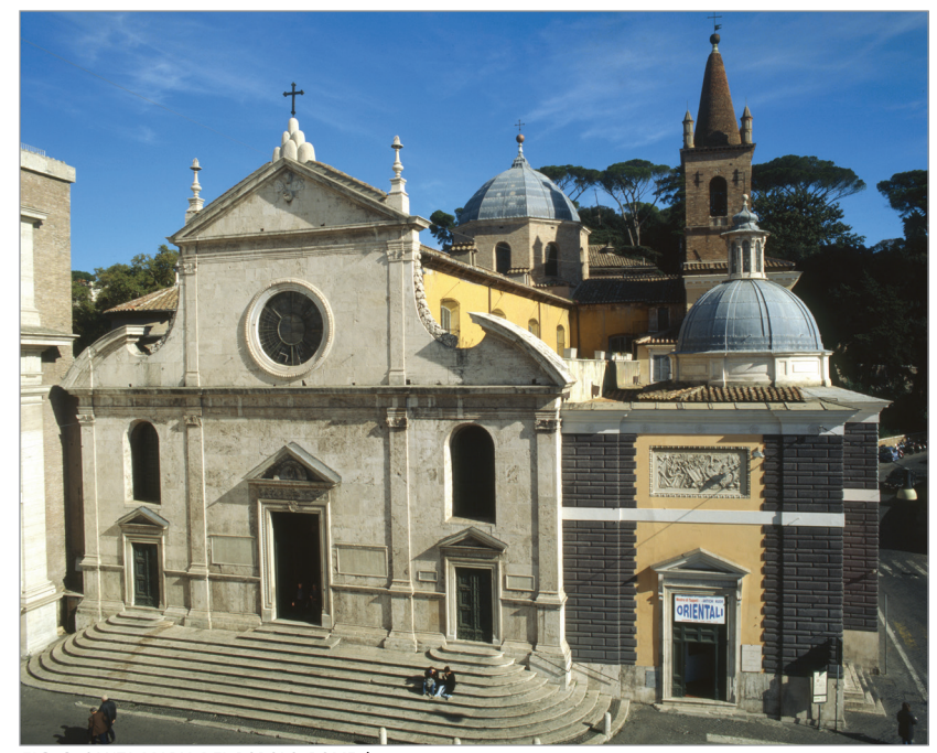
FIG. 2. SANTA MARIA DEL POPOLO, ROME.