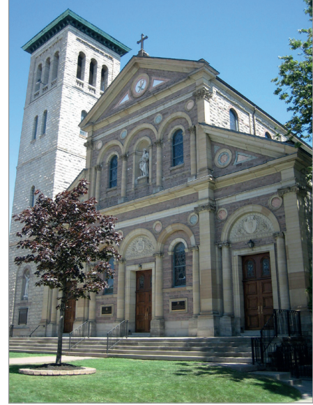
FIG. 5. MARIE-REINE-DU-MONDE BASILICA CATHEDRAL, MONTREAL, QC.