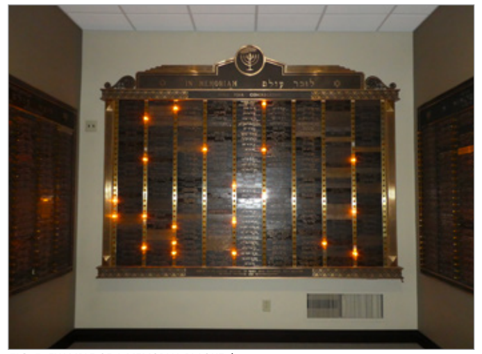
FIG. 5. EXAMPLE OF A MEMORIAL PLAQUE. | SHARON GRAHAM, FEBRUARY 2021.