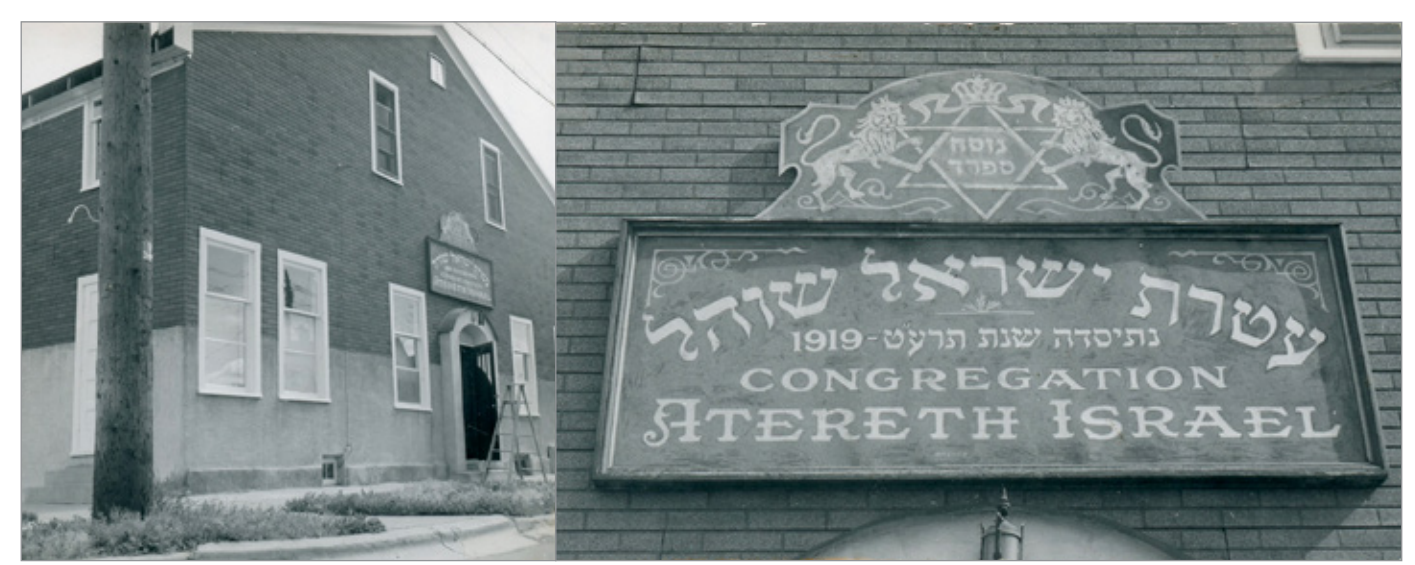
FIG. 11. EXTERIOR AND SIGN OF ATERETH ISRAEL SYNAGOGUE (1919), 469 MAGNUS AVENUE, WINNIPEG, MB.

amalgamating throughout the late nineteenth and early twentieth centuries, when Jewish immigration to Winnipeg was in full flow.