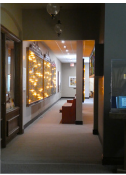
FIG. 3. ENTRANCE TO THE MEMORIAL LOUNGES FROM THE SOUTHWEST.