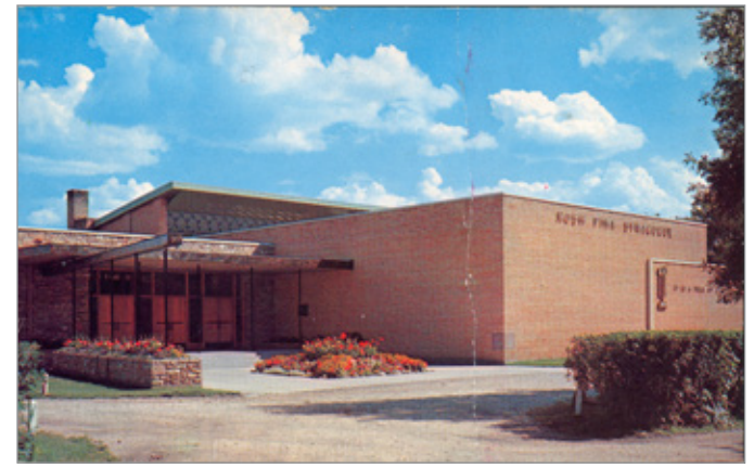
FIG. 9. EXTERIOR OF ROSH PINA SYNAGOGUE AS IT APPEARED ON A 1970S COMMEMORATIVE POSTCARD.