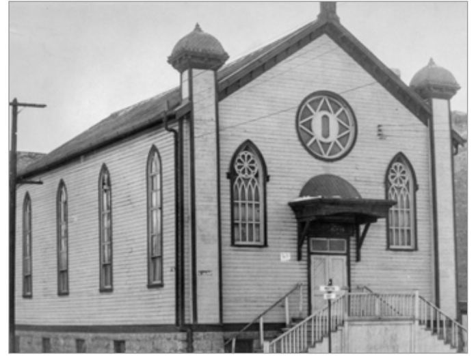
FIG. 7. EXTERIOR AND FRONT ENTRANCE OF ROSH PINA SYNAGOGUE (1893). | CREDIT JEWISH HERITAGE CENTRE OF WESTERN CANADA; PHOTO 30131.