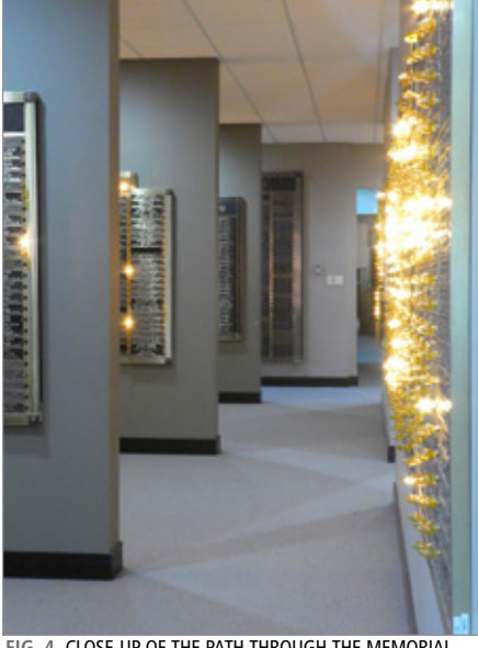
FIG. 4. CLOSE-UP OF THE PATH THROUGH THE MEMORIAL LOUNGES FROM THE SOUTH, ILLUSTRATING THE COMMEMORATIVE WALLS. | SHARON GRAHAM, FEBRUARY 2021.

this wing. The three rooms are divided like an upper-case letter E with an extra horizontal arm, with two walls, like two vertical dashes, standing next to them, thus making all the rooms open on one side. Figure 4 shows the edges of three of the four interior walls of the E-shaped construction which makes up the three rooms.