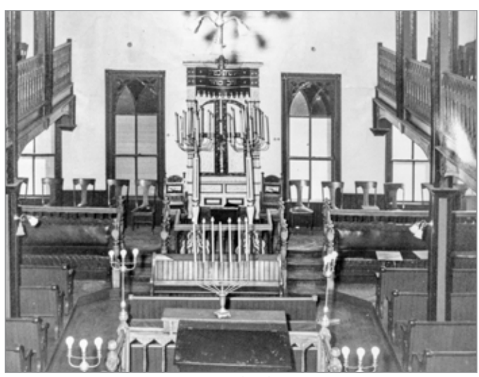
FIG. 8. INTERIOR OF ROSH PINA SYNAGOGUE (1893).

far less wealthy than Berlin or New York, and Winnipeg's Jews had fewer financial resources, especially in the first era of settlement in the city. Hence the 1893 Rosh Pina is a wooden structure, with such modest nods to Orientalist decor as the domes on the side towers and a rose window, which contrast eclectically with the Gothic fenestration on the sides of the structure. This early version of Rosh Pina, which may have only housed the sanctuary, a vestibule, and perhaps some additional space in the basement, was likewise modest even in the interior (fig. 8).