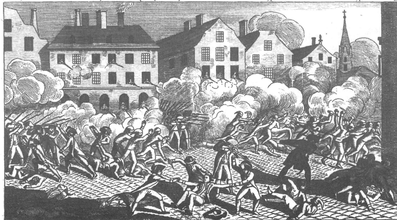
Le 2 Décembre 1792. Francfort a été repris par les Prussiens, d'après une trahison insigne. Environ douze cent Français ont été égorgés dans les Rues et places, par dix mille assaillans armés de bayonnes en forme de Poignards.