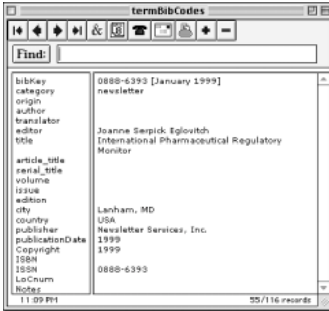
Figure 3. A Sample Bibliographic Entry

The above data fields are modeled on the ISO 12620 data categories as shown below (author’s comments appear in italic).