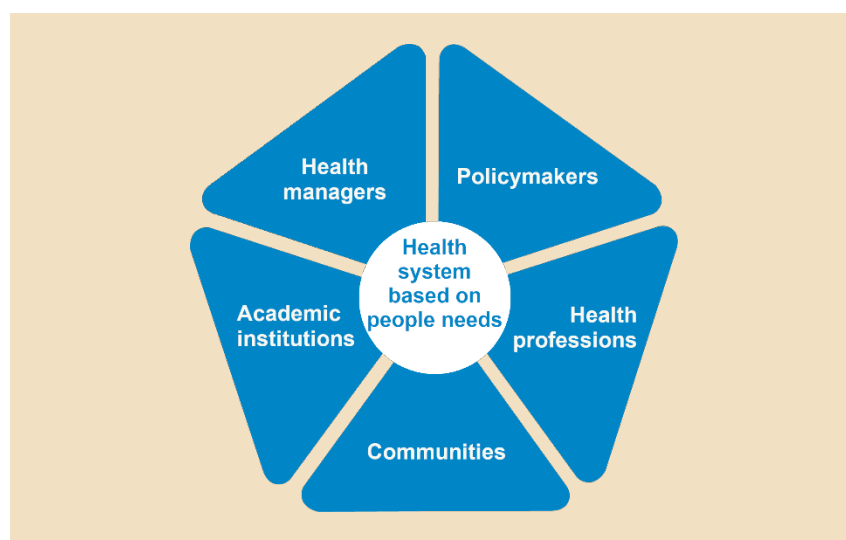
Figure 1 Towards Unity for Health (TUFH) Model