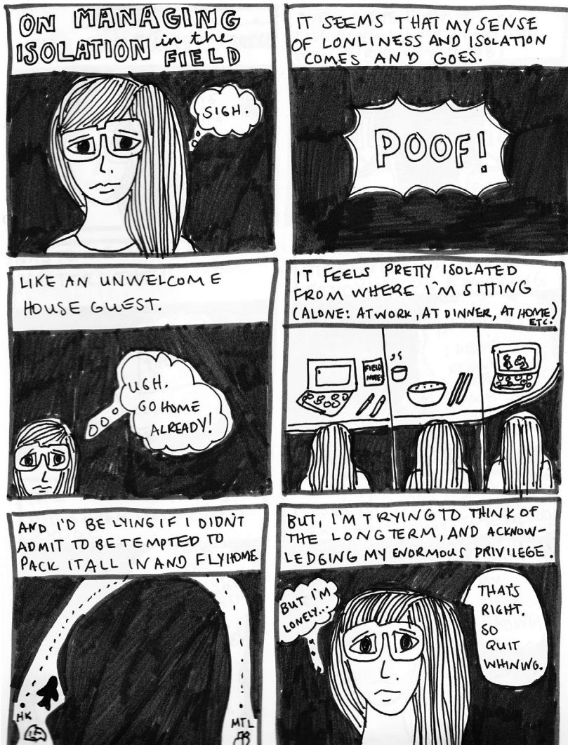
FIGURE 1. On managing isolation in the field (Burkholder, 2015a)

My doctoral project and visual fieldnotes are rooted in focused revisiting as reflexive ethnography (Burawoy, 2003). In engaging in revisiting as theory and methodology, I turned to Burawoy's work, which suggested that theory, reflexivity, and positionality should anchor ethnographic research that employs a revisiting approach. What does this mean? One type of revisiting looks to return to the field of study with the same population as a previous study, but at a new point in time. Here, the revisit does not encourage "replication" of a previous study, but rather, "to focus on the inescapable dilemmas of participating in the world we study, on the necessity of bringing theory into the field,