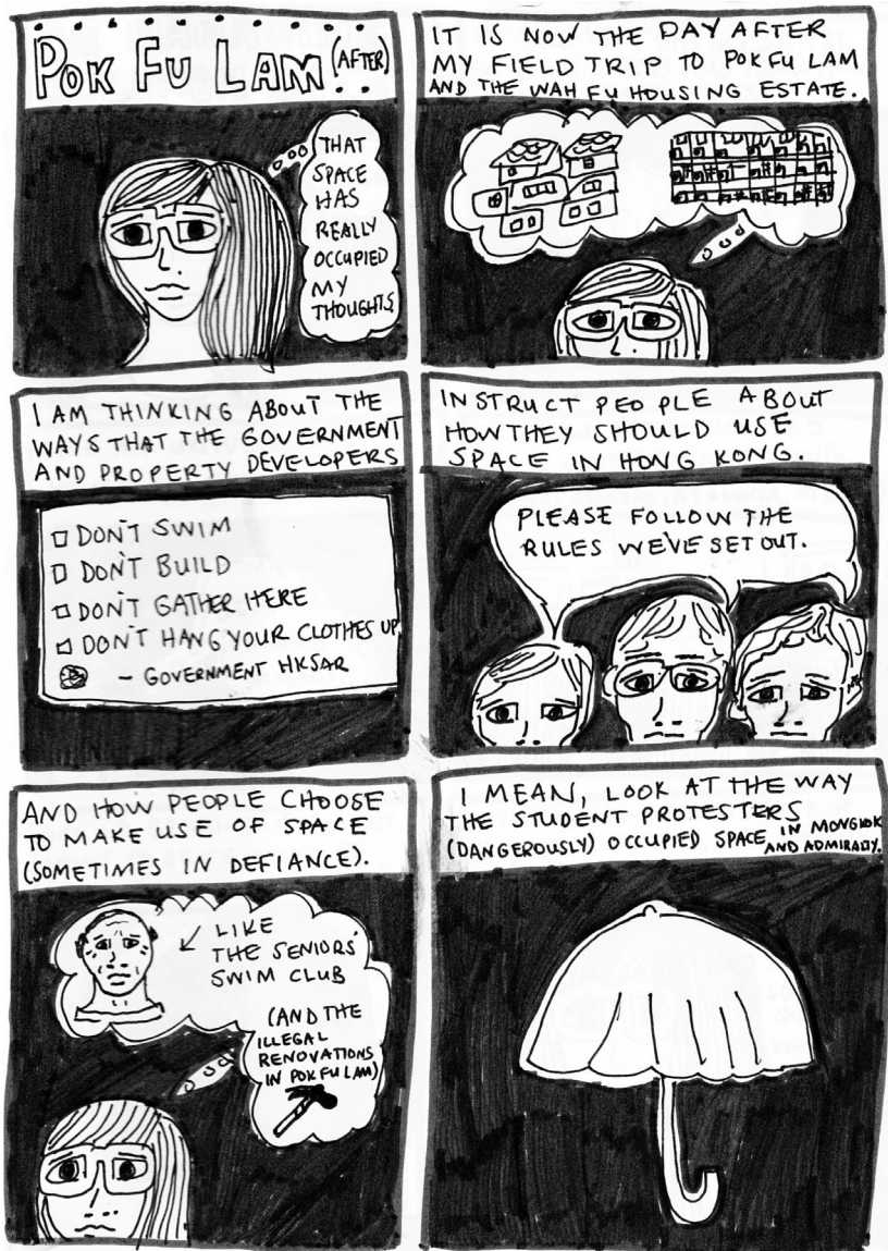
FIGURE 3. Pok Fu Lam (after) (Burkholder, 2015b)

In the evening, generally after dinner, I would sit in a public space and add the drawings to my writing. The following morning, I would add the definition and shading to my drawings, photograph each panel, and upload it to my blog.