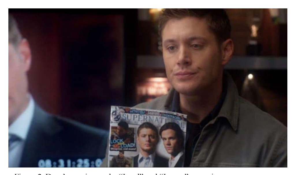
Figure 2: Dean's reaction to the "Jared" and "Jensen" magazine cover.

is equally apt for a series that no one expected to last much beyond its first season; creator Kripke himself finds its unprecedented longevity "surreal" (McGinnis 2019). Indeed, for a series with such a relatively small ensemble, Supernatural has proven itself remarkably flexible in terms of character beats and plots, including "remixing" earlier stories (such as Dean's decision to not serve as a vessel for the archangel Michael in season five ("Point of No Return" 5.18) with a different outcome. Yet on a narrative level, it also meets M.J. Clarke's definition of a tentpole text, in that it was "streamable ... available for exploitation in other media, and modular ... composed of disintegrative narrative parts disconnected with regards to traditional representations of time, space, and character" (Clarke 208). As indicated above, it not only produces significant ancillary material (an anime version of the first season (2011), the web series "Ghostfacers" (April 15-May 13, 2010) and board games/action figures, but also quickly adapted to the aforementioned production and distribution shifts. Indeed, it continues to gain new viewership through its availability on streaming platforms such as Netflix and Amazon in the United Kingdom.