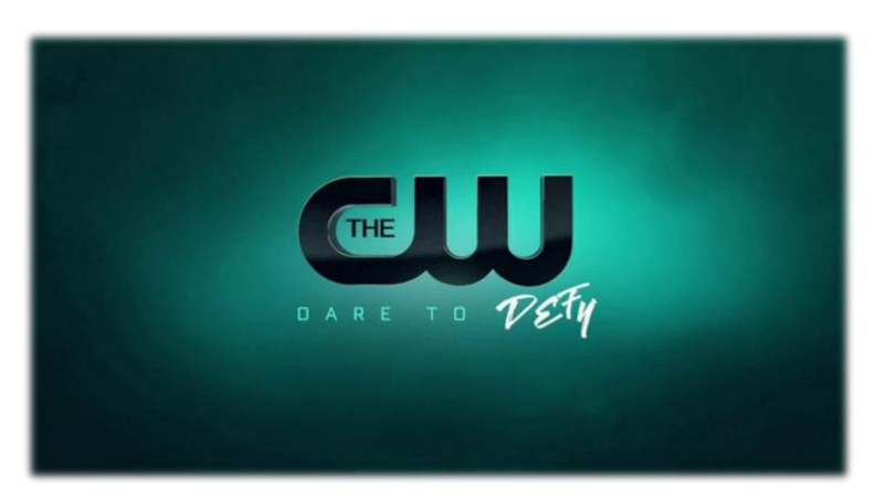
Figure 1: The CW's new logo and tagline

is, the primarily white casts of series such as Buffy the Vampire Slayer (1997-2003), Dawson's Creek (1998-2003), and Roswell (1999-2002). This promo featured the numerous series led by people of colour, including Roswell, New Mexico (2019-),