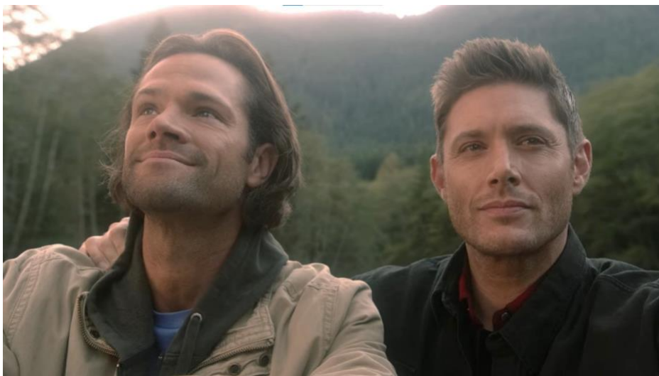
Figures 10 and 11: The clothes Sam and Dean wear in the pilot episode (1.1 top) are reproduced in the final scene of the series finale episode “Carry On” (15.20 bottom).