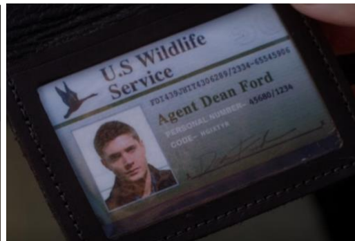
Figures 3 and 4: The U.S. Wildlife Service IDs used by Sam and Dean in the Season 15 episode "Proverbs 17:3" (15.5)