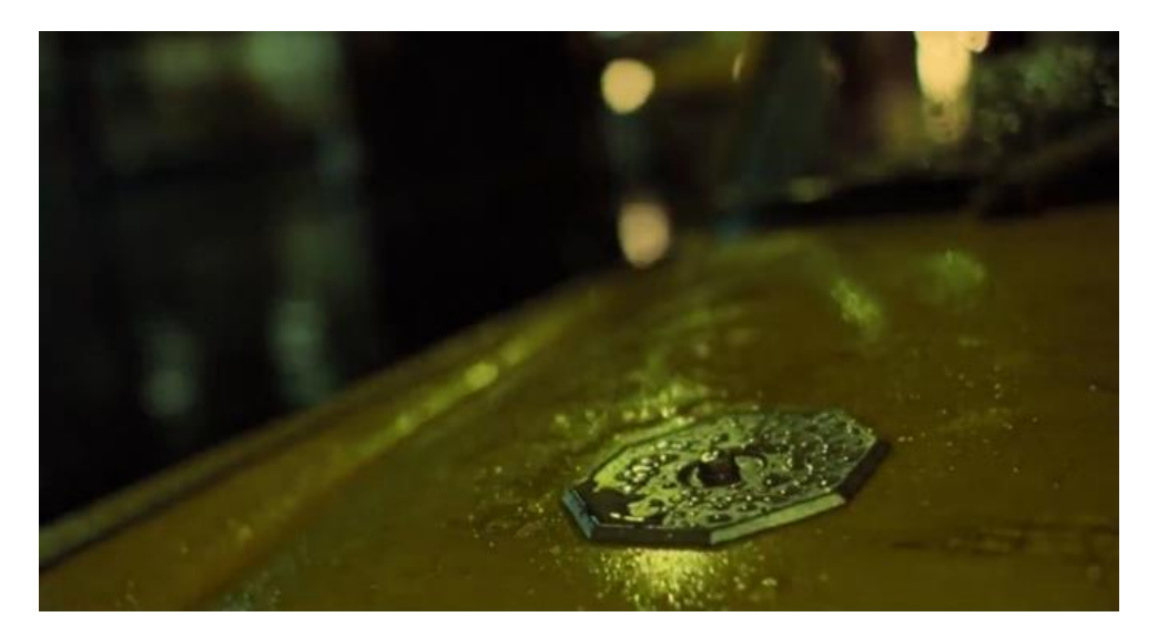
Figure 1: The tactile taxi.

they can experience his becoming. This allows the film to be effectively analyzed as a Deleuzian time-image. The film is an event that is continuously changing with the viewer or in Deleuzian terms becoming(-). The hyphen accompanying becoming further emphasises that it often does not have a beginning or an end in the development of the narrative. In other words, viewers and characters are so intertwined that there is no end, only becoming(-), a continual process of change. I utilize Deleuze's notion of the Time-Image to argue that Taxi Driver immerses the viewer in the anxieties of the on-screen bodies, particularly those of the lost and lonely Vietnam veteran, Travis Bickle, as the film lingers in the in-between of Travis becoming-hero and becomingantihero.