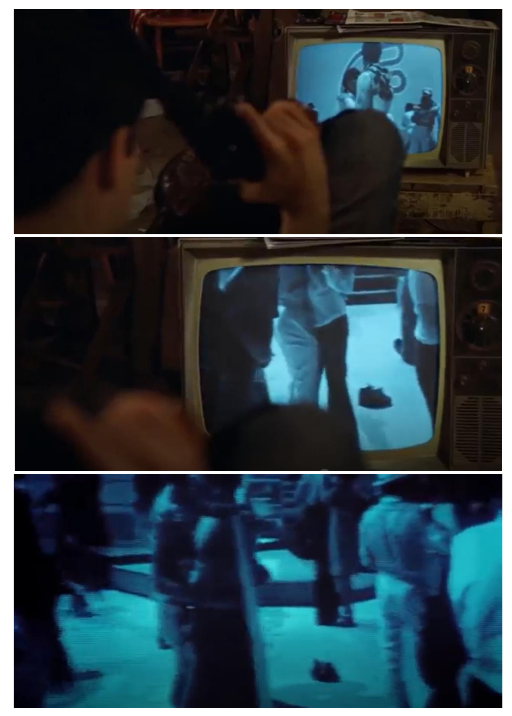
Figures 3-5: Sinking into the image, evoking in-betweenness.