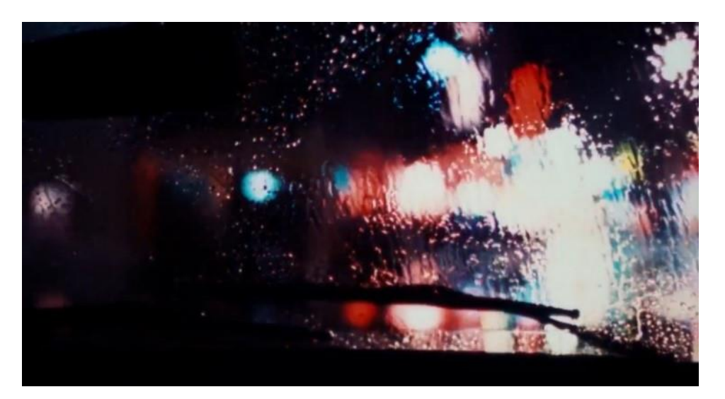
Figure 7: Keeping things enigmatic.

the film does not make this conclusive. Instead of using this moment to embellish the narrative, Scorsese keeps the scene enigmatic (Figure 7). Betsy is dropped off and the taxi drives away. The viewer watches as she turns and abandons them. The taxi embodies isolation, loneliness, and imprisonment. The limited vision of Travis' face confined in the rear-view mirror embodies this as well. The quick and sharp change in the imagery and music disturbs and confuses the viewer. The visuals seem to speed up and the smooth jazz is interrupted by an eerie sound. It is an editing style of experimental cinema which, "derails perception from its stable center, shuffling it along an unpredictable path of movements" (Flaxman, 22). This conveys the violent sensation that reality has collapsed for Travis. The viewer's reality is also distorted because they have been immersed in and interacting with the universe of the film. The viewer's reality is the film, similar to how Deleuze states that the brain is the screen. The film constantly affects the viewer in ways they did not consent to, since the images shown are unconventional and unexpected by the viewer. A does not move to B in a linear organic way. There is no distinction and therefore no progress. The viewer no longer even has the certainty that A was the beginning and B was the end. These temporal points of reference disappear.