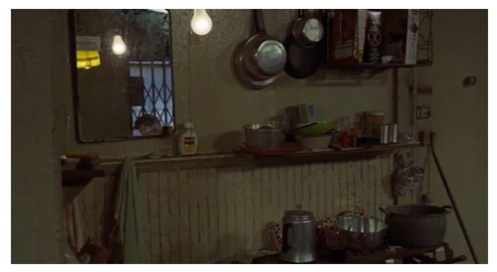
Figure 3: Disconnection, isolation and loneliness in Travis's apartment.

order, thereby realizing the ["molecular"] essence of the image" (Flaxman 2000, 19), which is especially powerful in the Time-Image. It is charged with lines of flight that allow the viewer to feel the "molecular" universe for themselves without "molar" intermediates. The apartment is part of a "molecular" universe, beyond being the place Travis inhabits. In a particular image from inside the apartment, the viewer is forced to watch Travis eat alone again. There is limited vision of one side of Travis through the reflection of a confining mirror, while the other side of Travis is also confined by metal grates on the window. This causes a feeling of claustrophobia. The light bulb and reflection of the light bulb elicits an impression of repetition, suggesting the viewer and Travis are again stuck in a loop. The surrounding walls are murky green and old, evoking a sort of nauseating bleakness. The apartment isolates the viewer and Travis in a becoming(-) space. Bowls, kitchen appliances, cereal boxes and other miscellaneous items are stacked in an attempt to be organized. Nothing in this setting gives an indication that there is a connection to other bodies from the world outside the apartment evoking a sense of isolation and loneliness in not only Travis, but encouraging it in the viewer as well (Figure 3).