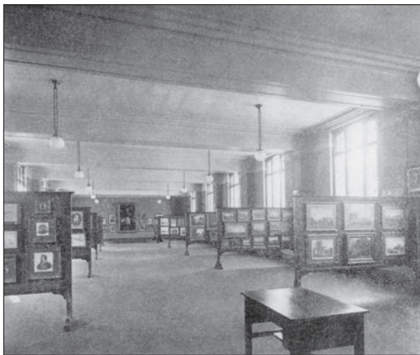
The John Ross Robertson Historical Collection on the lower floor of the Carnegie Library, reproduced from Globe, 10 February 1912.