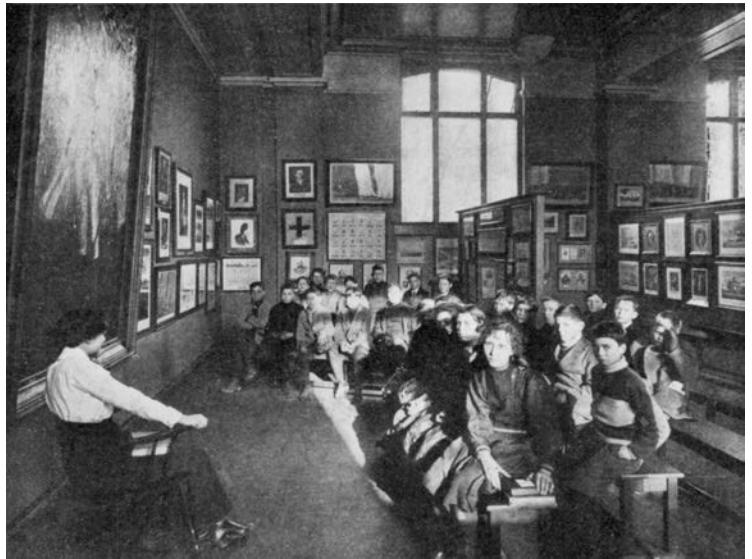
"The 'Story Hour' in the Public Library," Globe 12 April 1913. Photograph taken in the J. Ross Robertson Picture Gallery, lower level of the Toronto Public Library, College and St. George Streets.