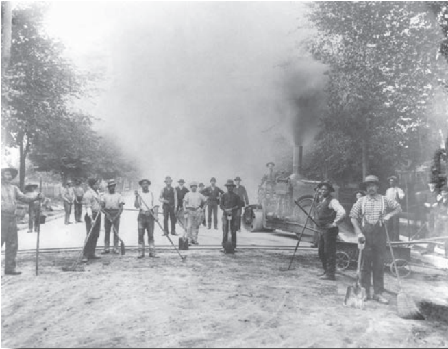
A Black and White road crew working together on the streets of Toronto.

Toronto he was greeted by a number of citizens who insisted Jackson be put on the mail route. The Prime Minister, understanding the importance of the Black vote in Hay’s riding, informed the deputation that Jackson would begin delivering mail immediately, an assertion that satisfied those present. 26 On 2 June, Jackson was sent out with one of