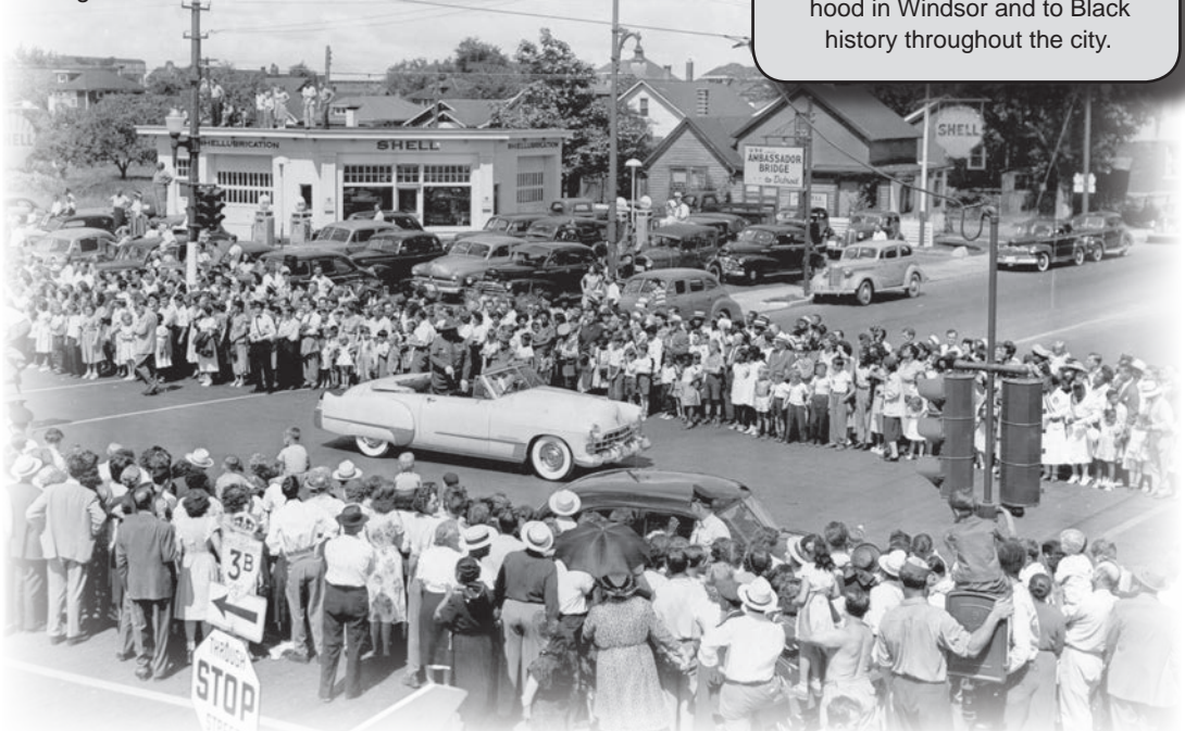
Emancipation Celebration Parade on Ouellette Avenue at Giles Boulevard, Windsor, c.1950.

Records relating to the residents, past and present, of the McDougall Street Corridor Neighbourhood in Windsor and to Black history throughout the city.