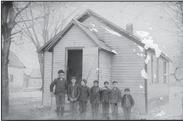
Children in front of the Marble Village Coloured School, c.1900. Black Ontarians banded together to create their own schools while, at the same time, challenging their exclusion from the public schools.

however, a certain amount of background knowledge on the topic is helpful. The key lies in discerning which government departments/ministries are most likely to have interacted with the persons in question at