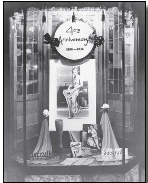
Fortieth anniversary window display, 1936. Anderson Department Store fonds, C5 Sb6 B1 F16 Item 8