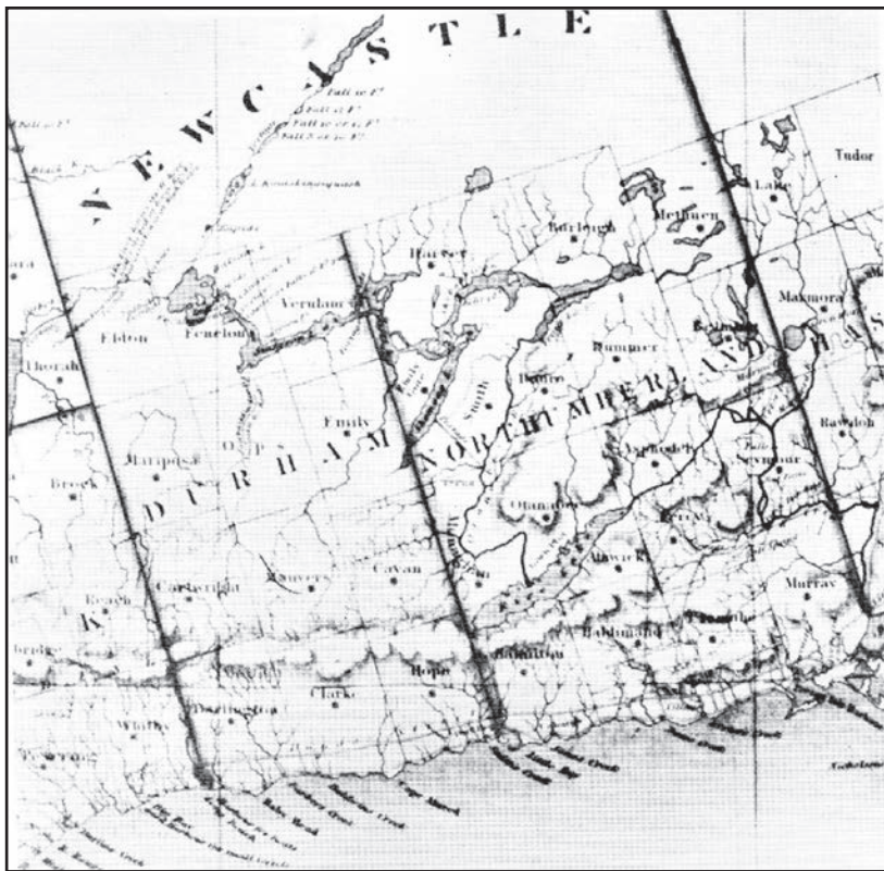
Figure 1: "Map of the Newcastle District." Taken from Watson Kirkconnell County of Victoria County Centennial History (Lindsay: Watchman-Warder Press, 1921).

ships were surveyed in the northern part of the District, those in Durham County generally by government surveyors, while in Northumberland County private citizens bid on the contract keeping nearly five percent of the land as payment. 9