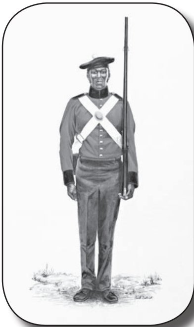
Figure 4: Standard uniform of the Upper Canadian Militia during the Rebellion period. Courtesy of Parks Canada, PD 733

Once enlisted, the men would be equipped with a uniform, accoutrements and a smooth bore muzzle loading musket. 60 The new recruits were drilled in a simplified version of the standard Brit-