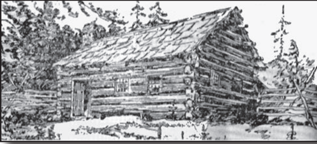
Smith's Tavern, near Hamilton, 1795. E.G. Guillet, Pioneer Inns and Taverns . Backwoods taverns offered the most basic of accommodations.

or two room log-cabin, located in the backwoods and providing only the simplest fare and accommodation (salt pork and whiskey, for example and the likelihood of shared beds), such as Smith's Tavern, above, shaped colonial public life differently than the solid minor houses that numerically dominated in the trade, and the handful of truly principal taverns or hotels that belonged primarily in urban centres. Travellers and colonists alike understood these backwoods taverns to be temporary affairs, dictated by the frontier conditions of settlement, and hardly ideal as the venues of public life and public entertainment.