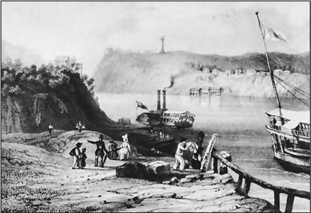
As W.H. Barlett's 1840 painting makes clear, Brock's monument was created to be seen prominently from the American side of the river.

ing angularity' of their New York modular skyscraper. The practical objectives which redesigning the city might accomplish were firmly subordinated to the symbolic representation of function.