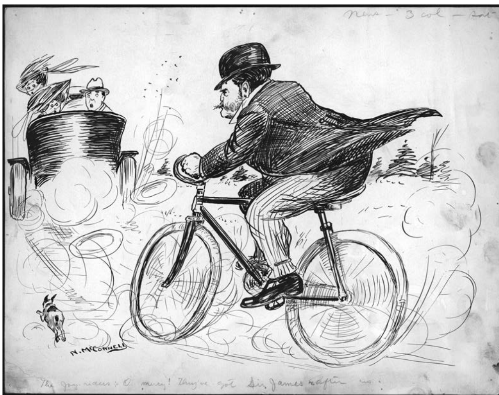
This 1905 Toronto News drawing, entitled 'The Joy Riders', shows an aggressive James Whitney pursuing a speeding vehicle. The caption reads: "Oh mercy! They've got Sir James after us.".