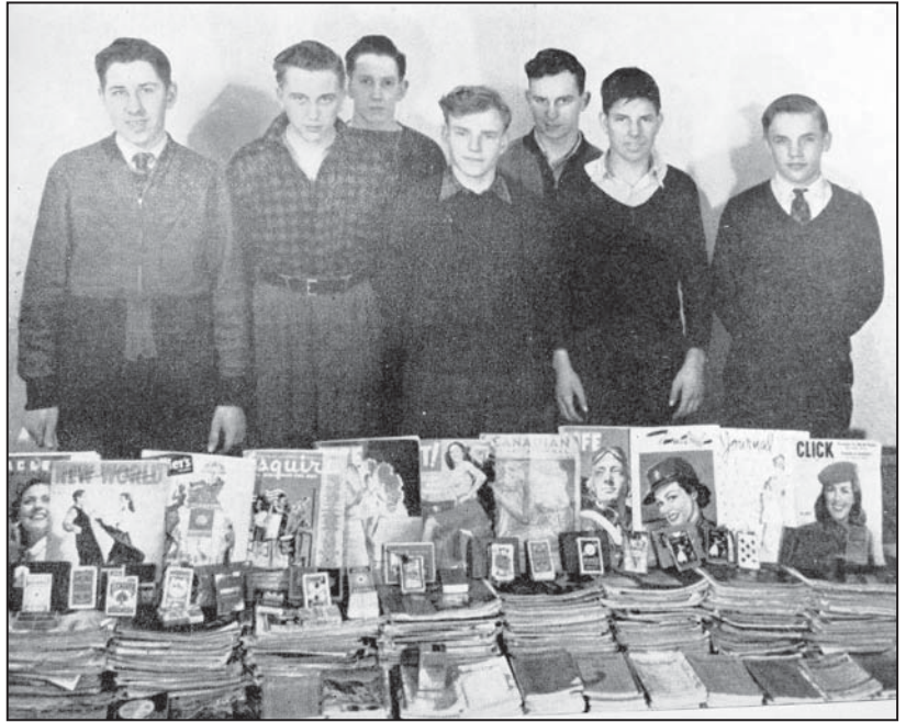
Figure 8: Male students at K.C.I. organizing donations for the Navy. Grumbler , 1944-1945.

prominent roles in traditional female wartime activities, girls began to take on more leadership positions within the student government and on the Grumbler executive. However, these changes were neither abundant nor long lasting, as younger male students were often the first choice to fill the