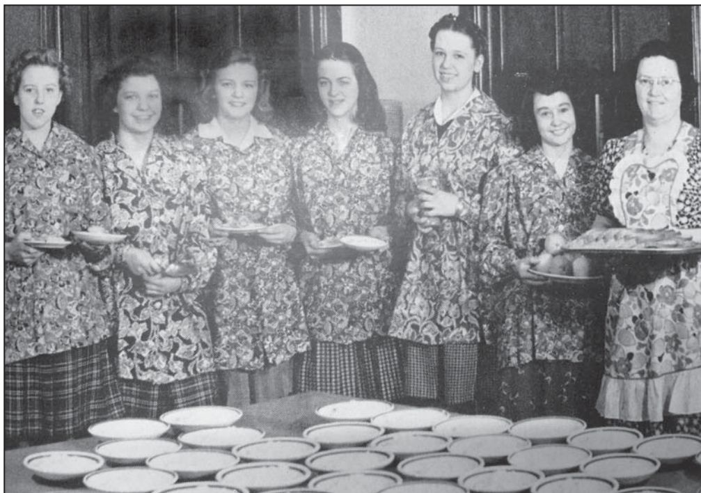
Figure 7: Female students at K.C.I. baking for the war effort. Grumbler, 1945-1946.

the arts, and were enrolled in classes to prepare them for becoming wives and mothers in the home. However, the war augmented their role within the school to include taking the lead on many organizations and initiatives for the war effort. Female students at K.C.I. organized the Junior Red Cross committee, raising money through weekly collections that taught girls to keep track of money. 52 Another activity of the Junior Red Cross was sewing and knitting as a group every week on Tuesday nights. Students practiced these important tasks that all girls were expected to know, while making