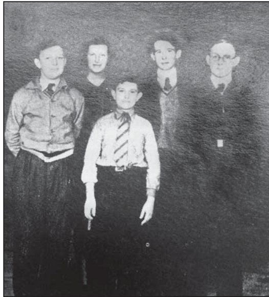
Figure 5: British war guests at K.C.I. The Anniversary Grumbler , 1980.

pride for the school. 43 K.C.I. also hosted a number of young British war guests for the duration of the war, such as those pictured in Figure 5. In an open letter