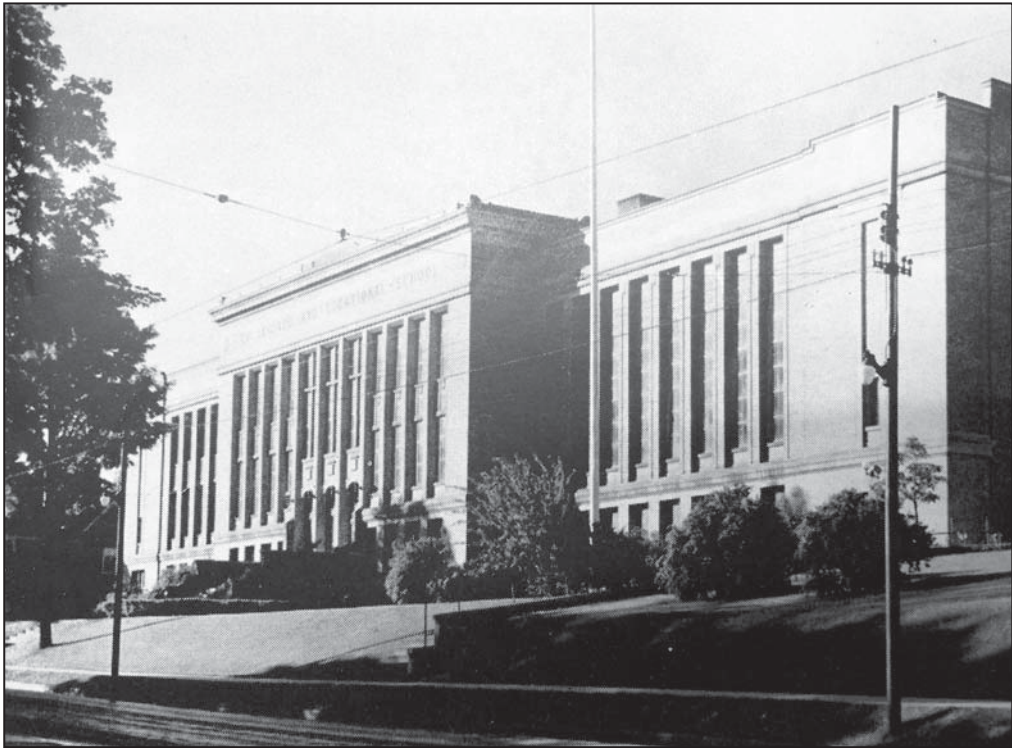
Figure 1: Photo of K.C.I. from the Grumbler , 1945-1946.

strengthened their character and prepared them for becoming productive Canadian citizens. Through an in-depth study of K.C.I. during the Second World War, examining student magazines and local newspapers, this article explores the wartime dynamics and experiences within one Canadian high school.