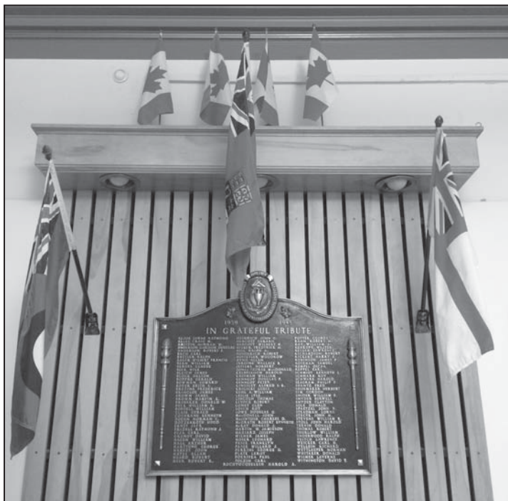
Figure 6: Student memorial at K.C.I. today.

pride in “[sending] the spirit of K.C.I. to our fighting men abroad.” 45 Students also created an Honor Roll of graduates of the school since 1937 in active service, displayed in the halls in recognition of their efforts. 46 For those who made the ultimate sacrifice, a memorial organ was dedicated to K.C.I. students killed during both world wars. As expressed in a late 1943 article in the Kitchener Daily Record , “May the resounding and stirring tones of this, our organ, always remind the students of KCI of our