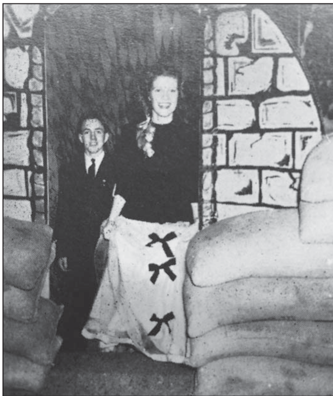
Figure 4: K.C.I. students at the "Blisskrieg Ball" in December 1941. Grumbler , 1941-1942.

the war effort. A leading example of this is the monthly tea dances that took place, with proceeds donated to the Red Cross. Figure 4 shows two K.C.I. students at a 'Blisskrieg Ball' themed Christmas dance in 1941. These dances were very popular among students, and their success was praised for demonstrating "the patriotic spirit of K.C.I." 37 In this way, students at K.C.I. were able to engage in many activities of interest to their generation, while also showing their commitment to the war effort and, therefore, their school community.