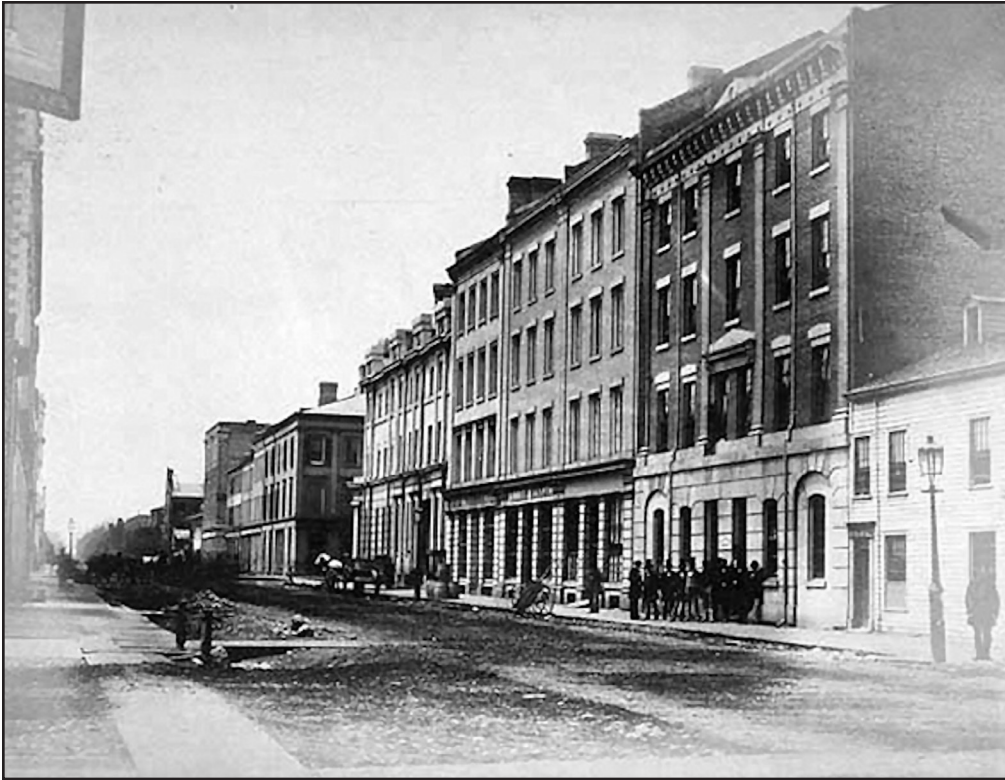
Wellington Street between Yonge and Church, c.1950s.

“garden” or farm land no matter where they were located in a city. This caused a significant decrease in the total amount of money received from taxation. The assessed value of land in Toronto following the enactment of this law declined from $22,881,000 in 1859 to $17,101,000 in 1862. While some of this decrease came about in other ways because of the depressed state of the economy, it was still believed at the time that a drop of over $1,500,000 was caused directly by the new assessment law, “which had the effect of taking the aforesaid one million