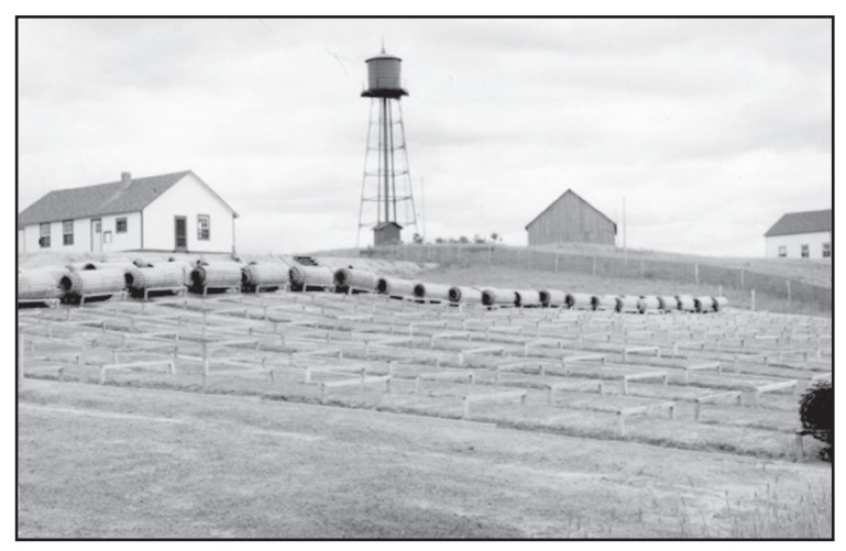
Image 2: Spruce Falls' Tree Nursery in Moonbeam. The nursery's infrastructure included a water tower, numerous buildings, and seeding and transplant beds. The former were the sites in which the tree seeds were first planted. To help the seedlings grow and their soil remain moist, they were protected by rolls of snow fencing that were unraveled and suspended on simple wooden braces that were spaced along the beds. The fences are coiled up and run through the centre of this photo, and their wooden supports are visible over most of the beds (Courtesy of Ron Morel Memorial Museum, Kapuskasing, Walter Baczynski Collection).