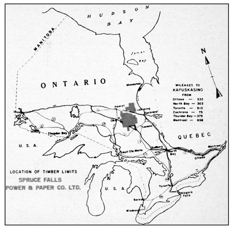
Image 1: Map of Spruce Falls Power and Paper Company's Timber Limits in Northeastern Ontario.

panies that built mills in the region during this period. Thereafter, the Ontario government was a full-fledged partner in this venture, which explains why the provincial politicians gave KC highly favourable leases in the early 1920s to the timber and hydraulic