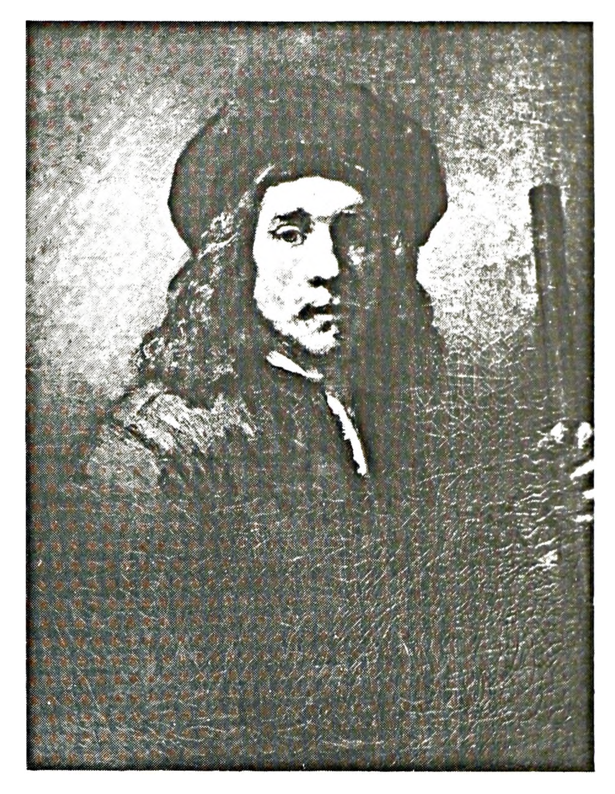
FIGURE 2. Rembraudt, L'homme au bâton. Paris, Louvre.

"Bonjour M. Gauguin" (W322), now in the National Gallery, Prague (fig. 2), shows Gauguin, carrying a switch, approaching a gate in the countryside near Le Pouldu. The vegetation is coloured an acid yellow-green and bare, gnarled tree trunks dominate the foreground; the sky is a deep blue with storm clouds coming. Gauguin strides toward us, wrapped in his great coat, his beret pulled over one eye, while the other eye is hooded as he looks down; his pinched, pale face betrays a desperate, lonely man. To the right, on the other side of the barrier, a Breton peasant woman moves away from Gauguin while appearing to look at him. The painting is quite clearly a counterpart to Courbet's Bonjour Monsieur Courbet (1854),<sup>13</sup> which Gauguin had seen just recently and probably discussed with Vincent. Gauguin was certainly aware of Vincent's imagery of the "traveller", since in December 1888 he had written to Schuffenecker