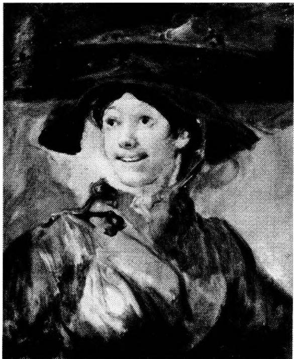
FIGURE 1. Hogarth, The Shrimp Girl . Paulson, Pl. 124.

Paulson is admirably clear. His greatest contribution to Hogarth studies is his critical catalogue Hogarth's Graphic Works (2 vols., New Haven and London, 1965; rev. ed., 1970), the indispensable reference for all future studies. His two-volume Hogarth: His Life, Art and Times (2 vols., New Haven and London, 1971) is not merely an interpreta-