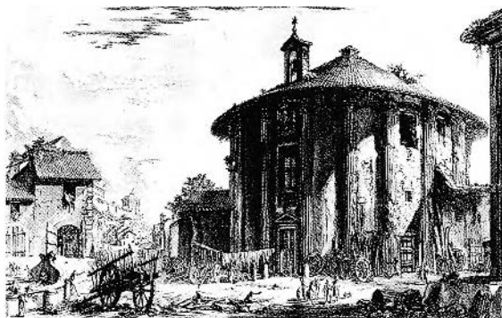
FIGURE 1. G.B. Piranesi, Temple of Vesta .

The prints of Giovanni Battista Piranesi combined the archaeologist's passion for accurate observation with a love of grandeur, mystery, and fantasy. Herschel Levit chose forty-one plates by Piranesi, largely from his Vedute di Roma (1748 ff.), and photographed the same views in order to contrast eighteenth-century Rome with the contemporary city. The etchings and the photographs are reproduced side by side with comments by the author. They are introduced by a brief biography of Piranesi and notes on his style and methods of work.