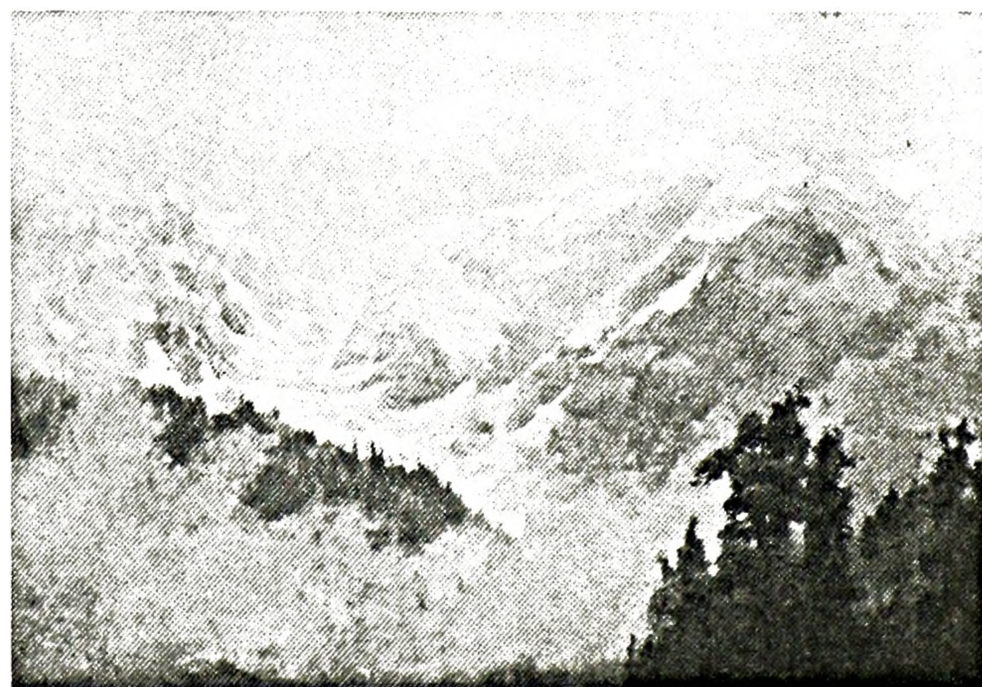
FIGURE 1. Frederic Marlett Bell-Smith, Mists and Glaciers in the Selkirks , 1911. Ottawa, National Gallery of Canada. Cat. no. 96.

These subjects might suggest considerable range; the mountains particularly could well have inspired some