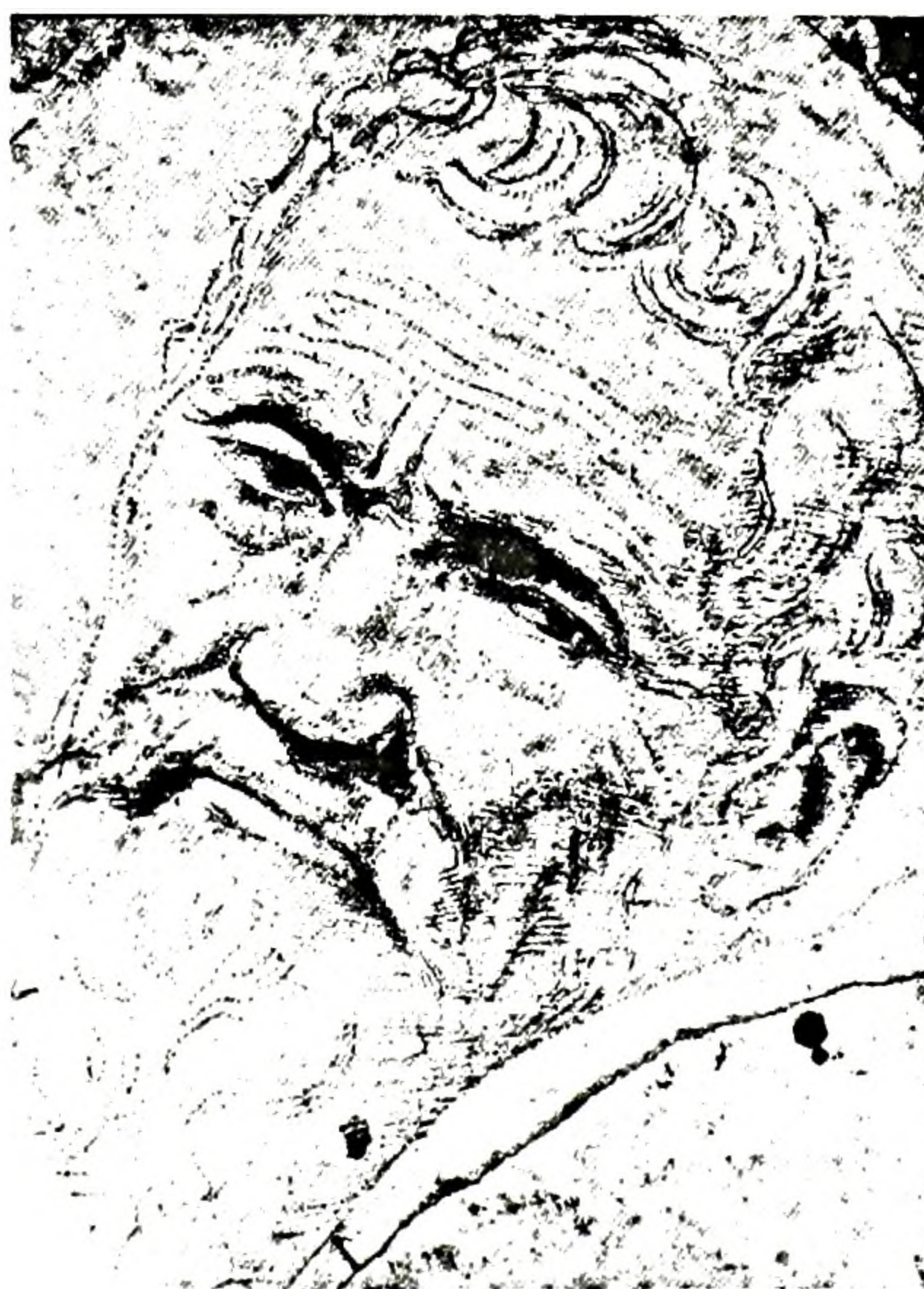
FIGURE 1. Daniele da Volterra, Michelangelo . Condivi, frontispiece.

Ascanio Condivi, a student of Michelangelo, wrote his biography in 1553, eleven years before Michelangelo's death at nearly eighty-nine in 1564. In a prefatory statement to the reader, Condivi points out several important fea-