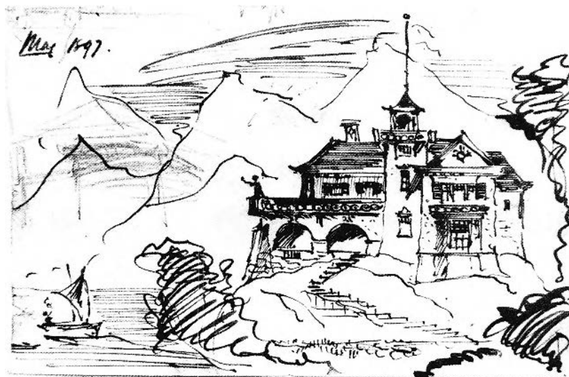
FIGURE 2. F.M. Rattenbury, Sketch for a house, 1897. Private collection.

from the recently discovered collection. 6 The motif of the sailboat is also seen on the elevation he had submitted successfully in the 1893 competition for the Parliament Buildings in Victoria.