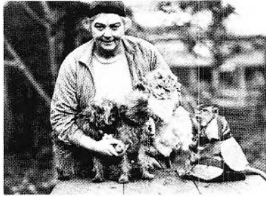
FIGURE 2. Mom and Family (Emily Carr and pets), mid 1930s. Tippet, p. 197.

familiar to readers of Growing Pains are illustrated in period photographs; individuals featured in Carr's writings under fictitious names are now assigned real identities and faces. The black-and-white photographs and reproductions of Carr's work (ten of which, of varying quality, are in colour) are scattered throughout the book and truly complement the text. Format and design are excellent. In sum, the book is eminently readable and, at the same time, useful as a research tool. The index is a welcome contribution, but a bibliography would have been helpful.