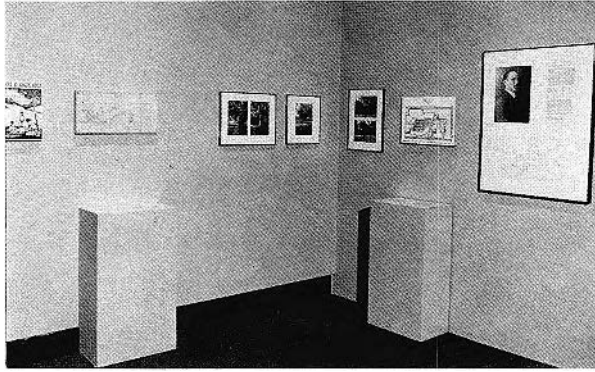
FIGURE 4. Frederick G. Todd. View of installation.

While many of the photographs in the exhibition are early views of works and are interesting in themselves – such as the Garden City Press at Ste.-Anne-de-Bellevue, which shows an industrial building in a garden setting, with tennis courts and a boulevard leading to ideal workers' housing – a few modern photographs show some of his works as they are now – the fulfilment of the plans. They provide convincing evidence of foresight and technical skill. None are more impressive in this respect than the modern views of Wascana Park showing the great parliamentary