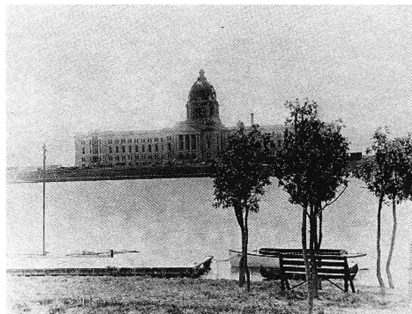
FIGURE 3. Frederick Todd, Wascana Park, Regina, with the Legislative Building in the background.

Memorial Park (a garden cemetery without tombstones) at Ville Saint-Laurent, and the Way of the Cross (a devotional garden for pilgrims visiting Saint Joseph's Oratory) at Montréal. The Town Planning group includes proposals made for the Ottawa Improvement Commission in 1903 (which comprised many of the features of later Ottawa plans), Shaughnessy Heights, Point Grey, and Port Mann in Vancouver, and the Town of Mount Royal at Montréal. The Public Works group includes St. Helens Island, Maisonneuve Park, Morgan Park, and Beaver Lake (a pond in Mount Royal Park originally proposed by Olmsted to make use of marshy ground that was otherwise of little value). All of the public works were Montréal make-work projects of the depression period, basically humanitarian and American in concept. One can imagine it was not an accident that Todd was commissioned to supervise their execution. He probably conceived them in the first place.