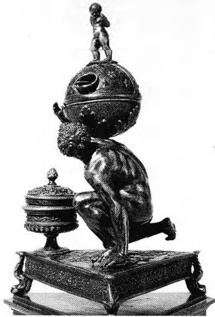
FIGURE 6. a) Atlas Supporting the Globe of Heaven, bronze, hollow cast, H. 34.6 cm. Normally attributed to the Workshop of Riccio, but possibly connected to the Workshop of Severo da Ravenna. The Frick Collection, New York, Inv. 15.2.24.

R.O.M.'s figure is more comfortably accommodated among those bronzes which are now generally, though as yet by no means conclusively, grouped around Severo di Ravenna. It is possible of course that some works among them may be related to a distinguishable if anonymous workshop hand. It is interesting in this light to be aware of some similarities apparent between the St. Jerome and a group of Atlas figures supporting the globe of heaven, which, although considered to derive from a Riccio model, could equally well have been cast in another workshop. 16 The tension in the pectoralis major muscles of the Atlas figures, as well as the ridge-like stylisations of the latissimus dorsi muscles find an echo in the coarser musculature of the torso of the St. Jerome . The protruding eyeballs of the Atlas bronzes, the stylisation of anatomical features within the arms, hands, chest and back are all perhaps as close to bronzes now attributed to the Severo workshop as to Riccio's. This is seen in the details of the Frick Atlas (Fig. 6 a-b) whose stand, for example, has ornamental details of the same form and style as those associated with writing caskets, such as that in the Cleveland Museum of Art, now attributed to Severo. 17 What is equally important is that the lid of the urn on the base of the Frick piece is of the same type as that appearing with the Museo