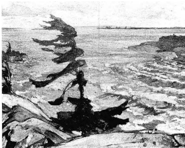
FIGURE 2. F. H. Varley, Stormy Weather, Georgian Bay, 1920-21. Oil on canvas, 132 × 162.6 cm. Ottawa, National Gallery of Canada.