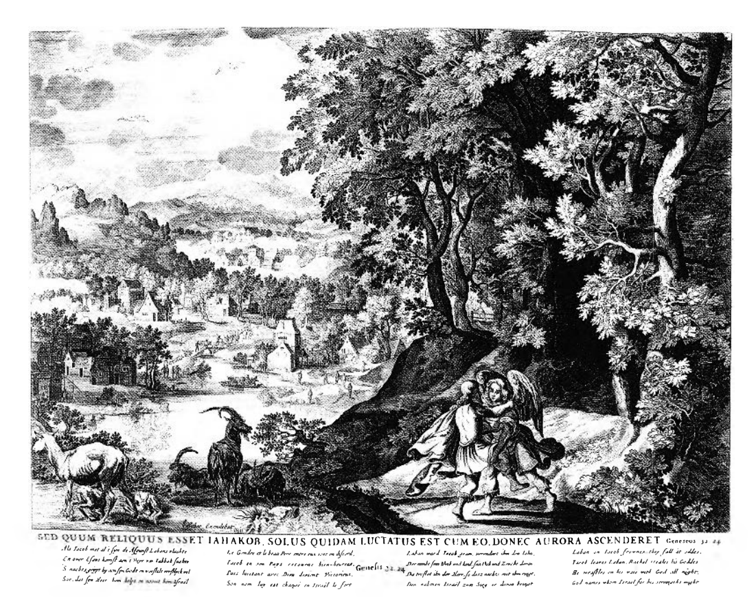
FIGURE 4. Anonymous, Jacob Wrestling with the Angel. From the Historiae Sacrae Veteris et Novi Testamenti (Amsterdam: N. Visscher, ca. 1670) (Photo: Courtesy Trustees of the British Library).