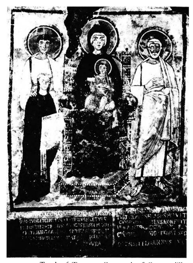
FIGURE 1. Tomb of Turtura, Catacomb of Commodilla, Rome.

Shortly after the burial of Turtura in the Catacomb of Commodilla, the suburban catacombs ceased to be used for their original purpose as places of burial. This shift from cemeteries outside the city to cemeteries within the perimeter of the Aurelian walls was complete by the second half of the 6th century,