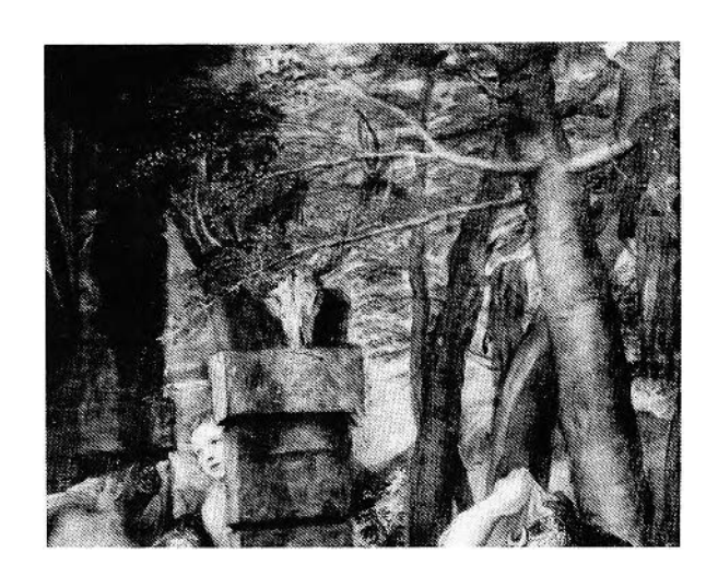
FIGURE 102. Titian, detail from Diana and Actaeon , Duke of Sutherland Collection, on loan to the National Gallery of Scotland.