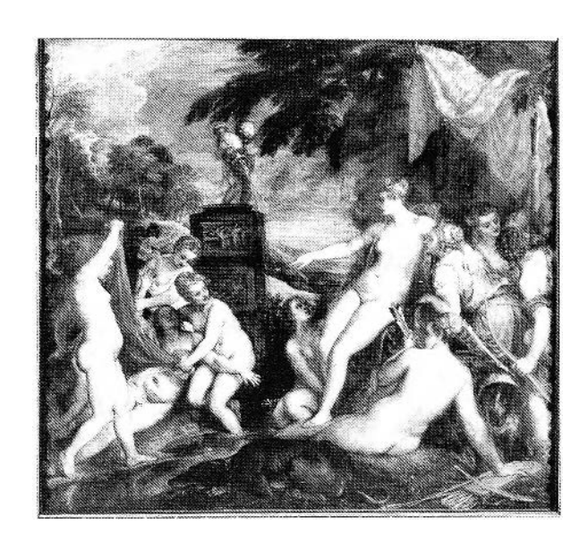
FIGURE 103. Titian, Diana and Callisto , Duke of Sutherland Collection, on loan to the National Gallery of Scotland.