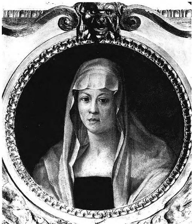
Figure 3. Giorgio Vasari, Maria Salviati de' Medici , 1556. Fresco. Sala Giovanni delle Bande Nere, Palazzo Vecchio, Florence.

against a pilaster, symbol of fortitude, fulfilling a decorum only recently prescribed by Castiglione, a sprezzatura that augments the implied courage of a potential man of arms. The pilaster may also be a veiled reference to the new Medici principato under the protection of the Emperor Charles V, one of whose imprese showed the eagle between two pilasters. 29 Finally, the identity of this boy raised from birth as the legitimate Medici scion is elaborately inscribed in the upper right field, COSMO.MED.