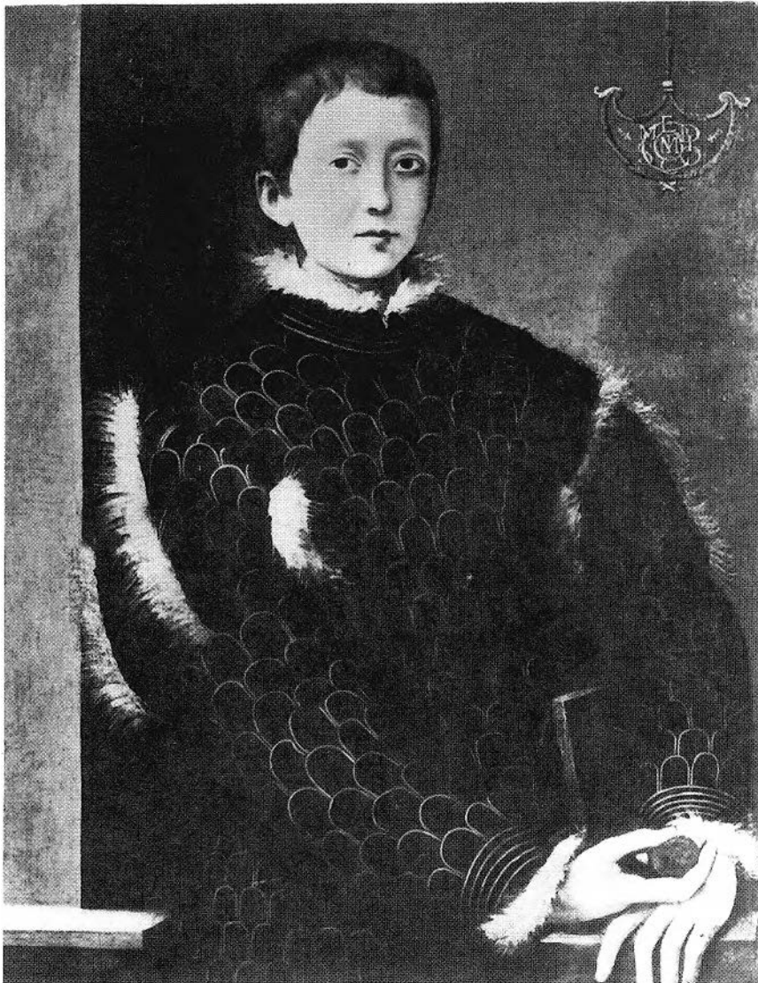
Figure 6. Ridolfo Ghirlandaio, Cosimo de' Medici at Age Twelve , 1531. Oil on panel, 86.5 x 66.5 cm. Florence, Uffizi, Inv. Ville 1911, Castello no. 274 (Photo: from G. Poggi, "Di un ritratto inedito di Cosimo de' Medici, dipinto del Ghirlandajo nel 1531," Rivista d'Arte , IX (1916-18), fig. 1).

A star sì mesto, il suo gioir, ch'infinge In lei sempiterna, allegro Ti renda, non dirò, ma tempi in parte, La noia che comparte La carna inferma al cor doglioso. . .[sic]. 50