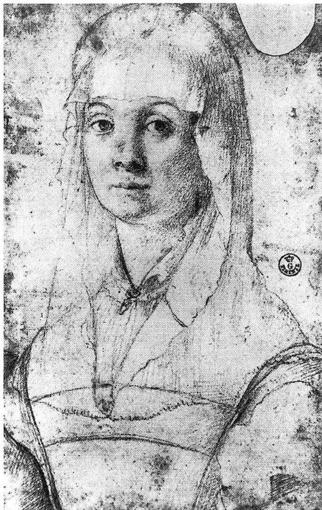
Figure 4. Agnolo Bronzino, Maria Salviati as a Young Widow, ca. 1527-30. Drawing, black chalk, 20.2 x 12.3 cm. Florence, Uffizi Gabinetto Dis. e St. no. 6680F.

the earliest date that can be proposed for the Baltimore portrait—exposing him for two years to powerful European interests. He was received officially by the Doge, the Papal Legate and the Venetian Council, and was presented to the ambassadors of France and England. 34 Cosimo's exile with her in Bologna shortly after allowed him to witness Clement's historical coronation of Charles V in 1529. 35 When the frugal Maria hesitated to attend the marriage of Caterina de' Medici in Marseilles in 1533, her father, Jacopo Salviati, urged her not to forgo this opportunity to keep Cosimo at the forefront of European interests. 36