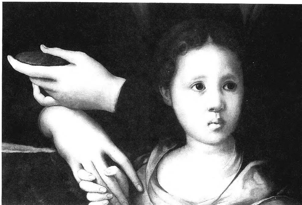
Figure 2. Pontormo (Jacopo Carucci), Maria Salviati with Giulia d'Alessandro de' Medici , circa 1540, detail, Giulia de' Medici . Baltimore, Walters Art Gallery.

This last portrait is a copy of Ridolfo Ghirlandaio's Portrait of Cosimo de' Medici at Age Twelve of 1531 (Fig. 6), and Pontormo's profile portrait of 1537 is the source for another portrait of Cosimo as a youth in this setting. Oddly, the Baltimore child does not reappear in the cycle or in any of the multiple sets of Medici family portraits commissioned by Cosimo. These include Medici children from babyhood to adolescence. 22