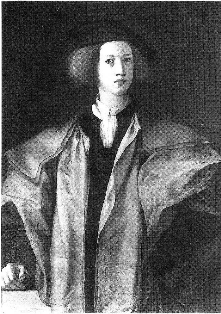
Figure 7. Pontormo (Jacopo Carucci), here identified as Giulio d'Alessandro de' Medici , ca. 1544-46. Oil on panel, 85 x 61 cm. Lucca, Pinacoteca.

Lucca boy. Neither have offered an alternative proposal; as recently as 1990, Luciano Berti also left the identification of the youth open. 76