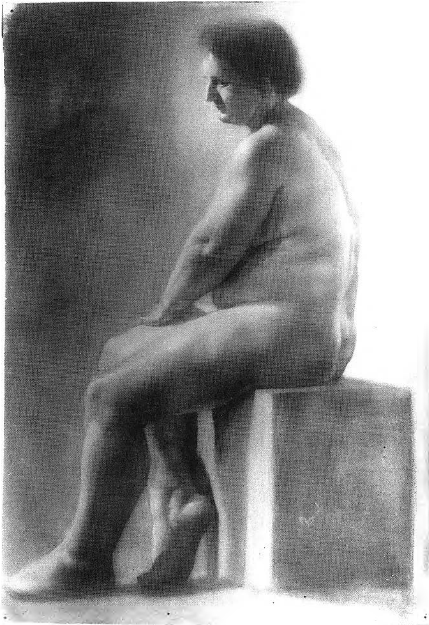
Figure 2. Figure study, drawing, 100.0 x 70.0 cm. Not signed nor dated. Location unknown.

derstanding of proportion and musculature (Figs. 1-2). In spite of difficulties in drawing and painting the figure — “my big problem,” he writes, “is in working with masses and losing the timidness in me which looks for details and secondary problems in relation to what is important for the drawing” — Chambers assured Greenshields that he was able to overcome the technical challenges. 22