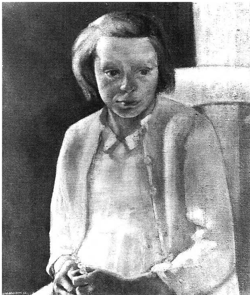
Figure 4. Portrait study, painting, 55.8 x 43.2 cm. Signed and dated blc.: Chambers 56. Location unknown.

After returning to Canada in April 1961, he radically altered his approach to painting and based it on an adaptation of the pictorial process that he had learned from Stolz and on the metaphor of organic growth. 29