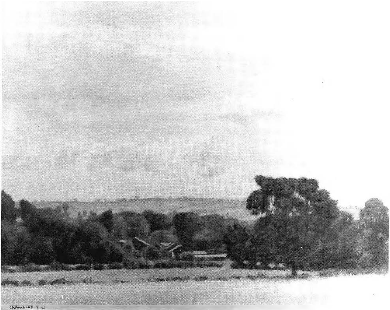
Figure 3. Landscape, painting, 55.8 x 71.1 cm. Signed and dated b.l.c.: Chambers 7-56. Location unknown.

grows to maturity, so the idea is the vital core of a work of art. He writes: