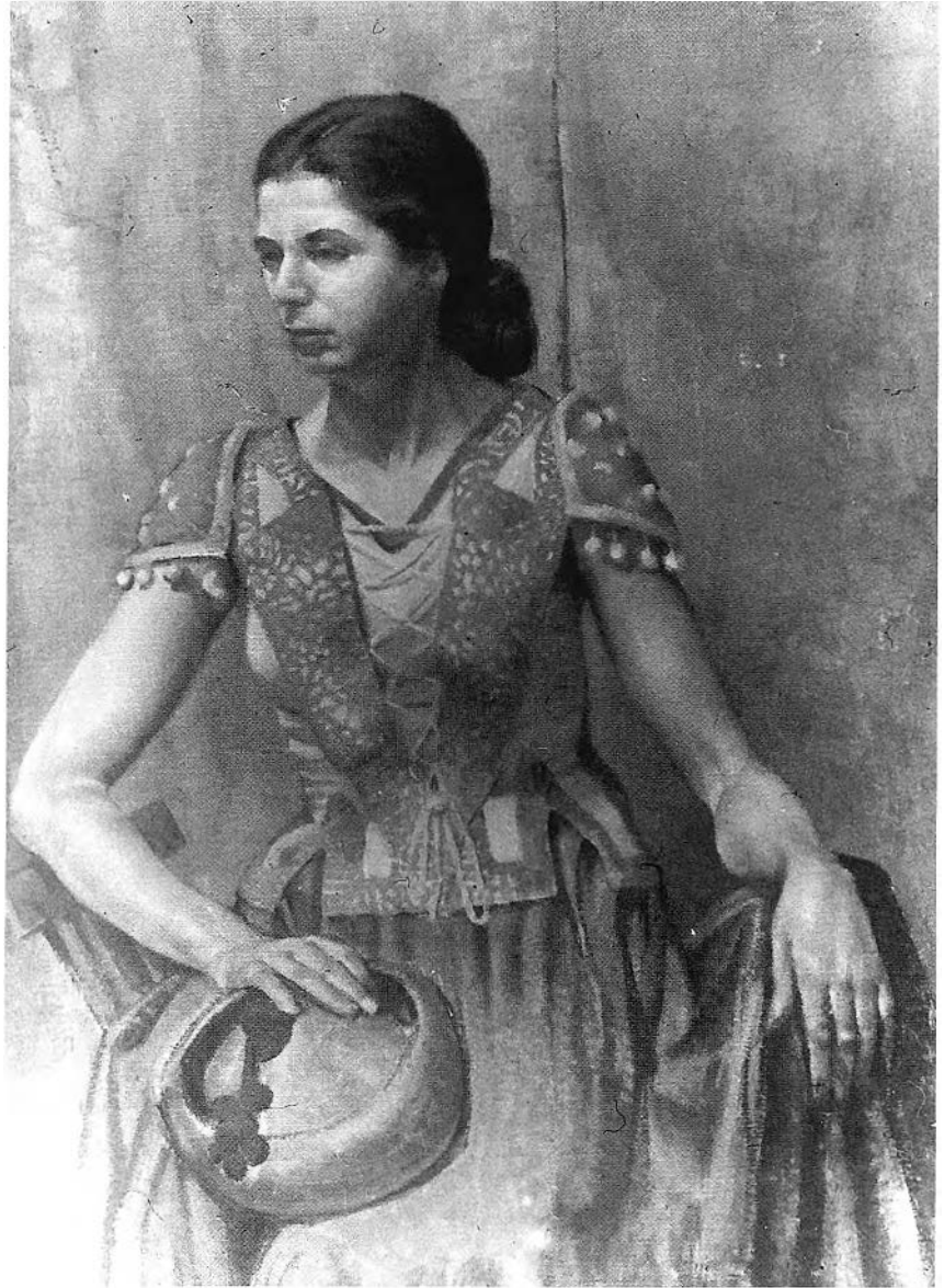
Figure 7. Figure Study, painting, 100.0 x 81.0 cm. Not signed nor dated. Location unknown.