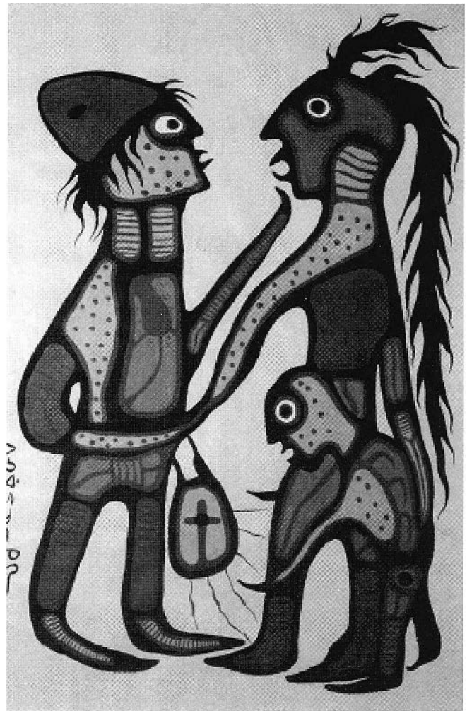
Figure 2. Norval Morrisseau, The Gift , 1975. Acrylic on kraft paper, 196 × 122 cm. Thunder Bay, Thunder Bay Art Gallery, Helen E. Band Collection.

artist fundamentally shifted the power dynamic that he was exploring in his art. Maintaining a similar earthy colour palette, Morrisseau in The Gift again employs green and red to exhibit areas of the heart and the brain as juxtaposed focal points and world views. However, the body politics of the two forms changes to further elucidate the contested space of hybridity.