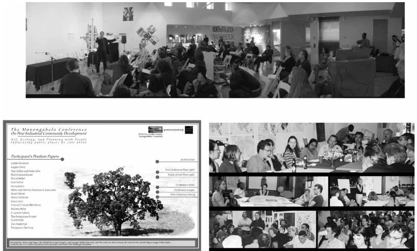
Figure 3. The Monongahela Conference Programs: Grant Kester provides the closing keynote for the 2005 conference, Friday-night dinners, and public meetings from the Monongahela Residencies; and the Greenmuseum website/archive from the first Monongahela Conference. 3 Rivers 2nd Nature, STUDIO for Creative Inquiry, Carnegie Mellon University.

place-based interests and practices yet recognizing the significant differences and challenges when you look at this work as an international field of practice, functioning in situ without significant institutional presence.