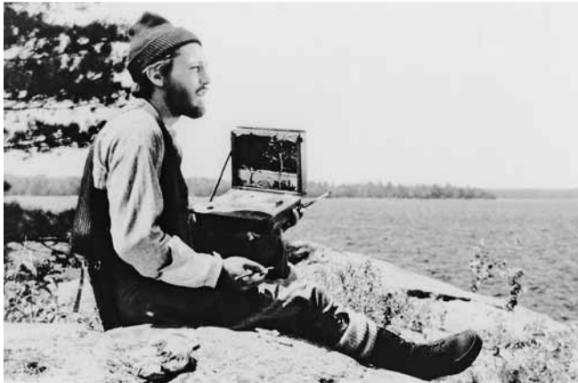
Figure 2. Joyce Wieland, The Far Shore (Tom McLeod), 1976. Film: 106 minutes, colour, 35mm.

environment. In her artistic production Wieland extends this understanding of aboriginal cultures and identities in order to draw attention to the consequences of exploiting the land for capitalist gain, a strategy that constructs aboriginal peoples as both intimately connected to the natural environment and as victims of capitalist modernity.