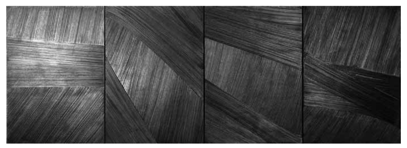
Figure 3. Pierre Soulages, Peinture 222 x 628 cm, avril 1985 . Oil on canvas, 222 x 628 cm; four panels, each panel: 222 x 157 cm.