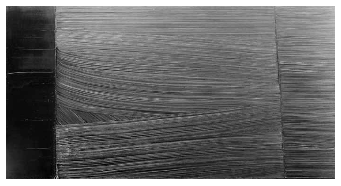
Figure I. Pierre Soulages, Peinture 162 \times 310 cm, 14 août 1979. Oil on canvas, 162 \times 310 cm.

the fall of 1979,10 which featured eight paintings from that year and fifteen paintings done between 1969 and 1978. The difference between the last work from 1978, Peinture 114 x 162 cm, 17 octobre 1978 (no. 775),11 and the first work from 1979, Peinture 162 x 114 cm, 27 février 1979 (no. 781), was immediately visible. In the 1978 work Soulages played on the contrast between two tonal values of dark colour by superimposing large marks in opaque black on a ground entirely covered by a thin coating of lighter black. The 1979 painting, the first existing work in the series of ultrablack paintings, contained three non-textured black rectilinear bands variably posed on a black textured ground. The organization of striated and non-striated areas was still hesitant, and the pictorial surface contained some unpainted areas on the upper right, lower left, and right corners. But, the heavily striated, black on black configuration already revealed the advent of a new technique of making a painting by repeated applications of pigment combined with subsequent erasures and disclosures of the ground, the marks, and the traces of those marks. The juxtaposition of scored and smooth areas first appeared distinctly in Peinture 162 x 127 cm, 11 avril 1979 (no. 785), and, three days later, Peinture 162 x 127 cm, 14 avril 1979 (no. 786) revealed the full potency of an ultrablack painting. In the latter work the textured skin of black