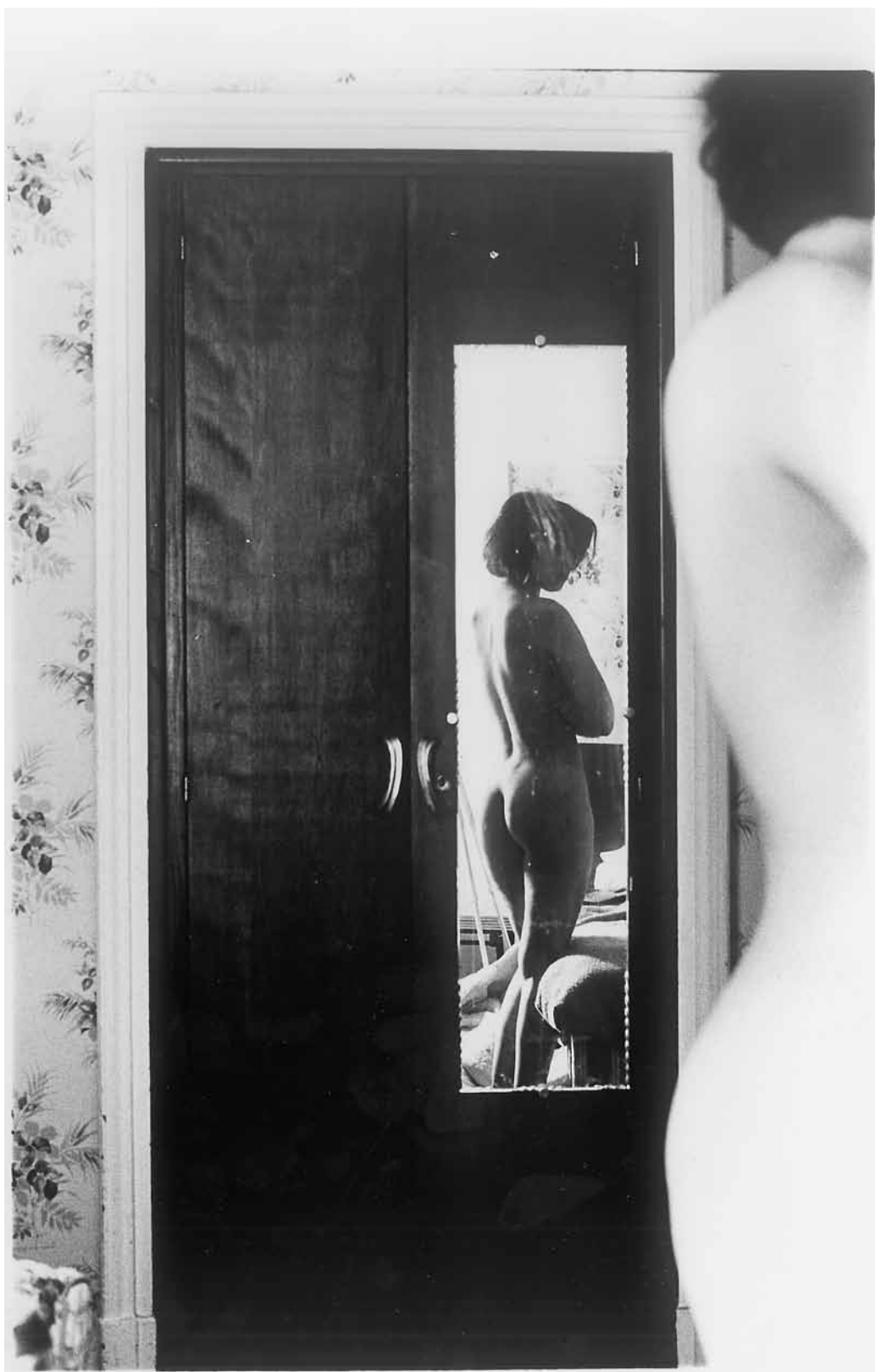
Figure 2. Alix Cléo Roubaud, La Bourboule, chambre 14 (Photo courtesy Jacques Roubaud and Éditions du Seuil).