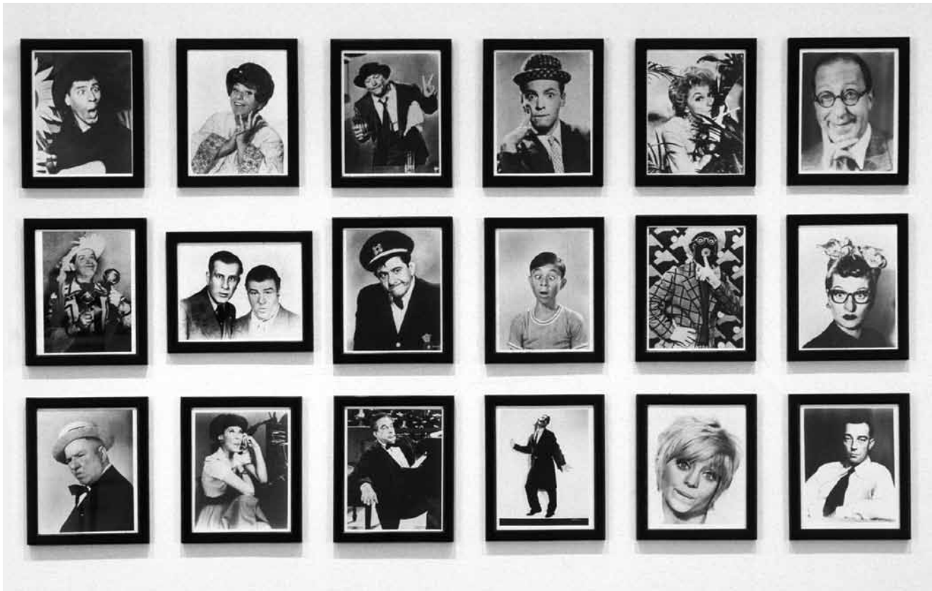
Figure 3. David Robbins, Self-Parody , 1991. Collection Museum of Contemporary Art, Chicago. Courtesy of the artist (Photo: David Robbins).

been historicized as one of the driest and most serious artistic movements of the twentieth century. 22