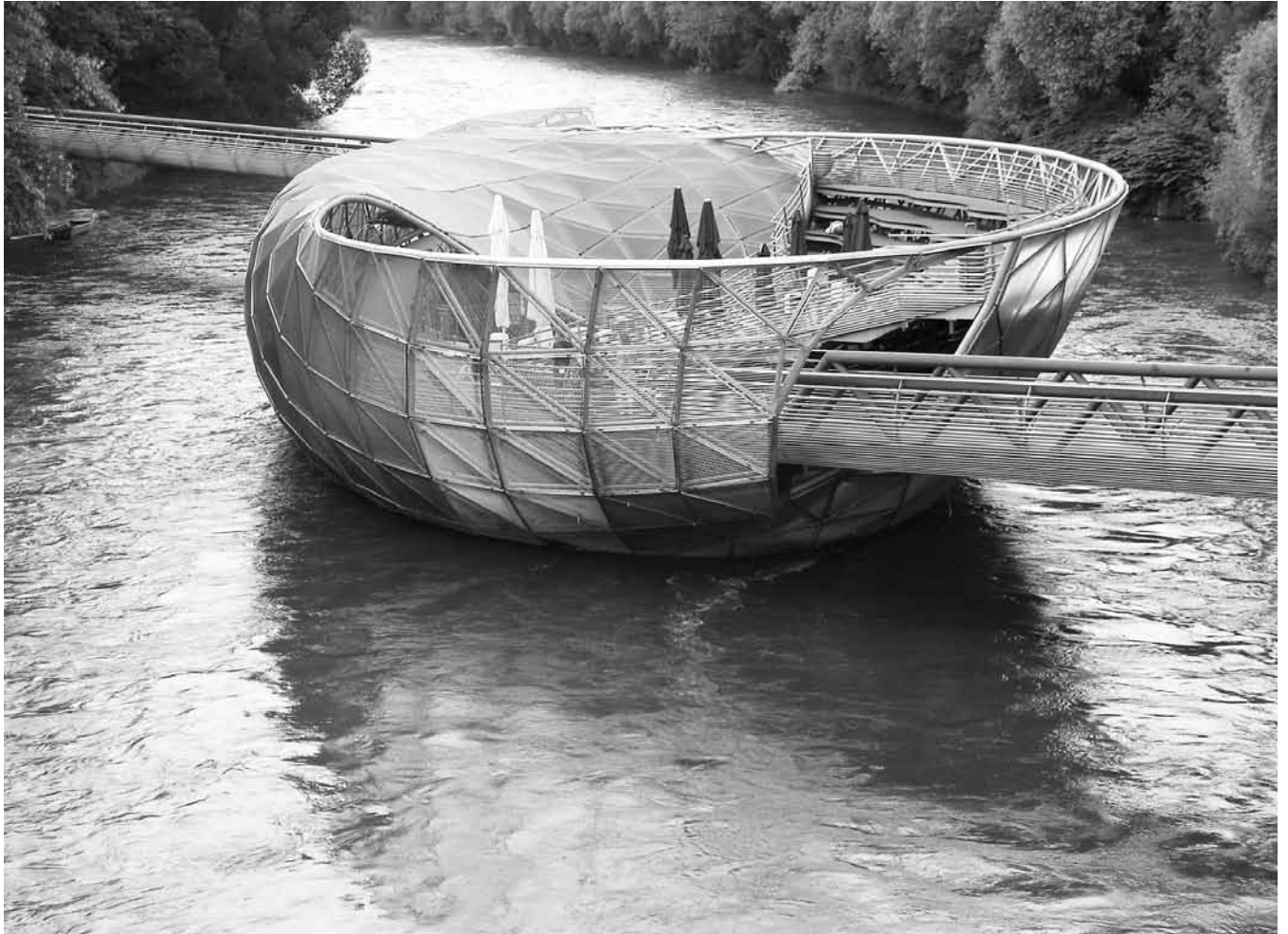
Figure 6. Acconci Studio. Mur Island , Graz, Austria, 2003.

made at the Bauhaus and its antecedents between pure art and design for production, between the “irrational” and “rational” avant-gardes. Buster Keaton meets Mies van der Rohe.