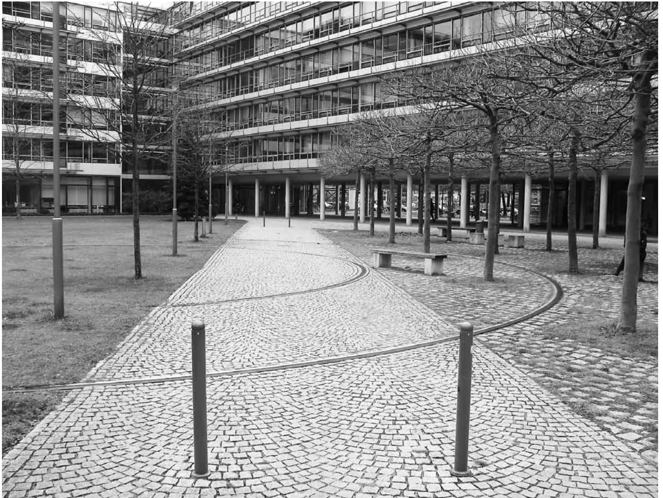
Figure 4. Acconci Studio. Courtyard in the Wind , Munich, Germany, 1997. Tower, turbine and courtyard.

place where the terms of the made world are to be loosened or un-fixed, where one can actually get at and change the grounding of the design process, is also central. 33 Acconci's play begins at the threshold of public and private space and extends beyond the hermetic boundaries of the art world in a conversation contextualized by experiment and implication in urban space. He explains, "We do think of a peopled space, so that we can take hints from the program, we like to double the program, or multiply the program, we like it not to have just a single program." 34