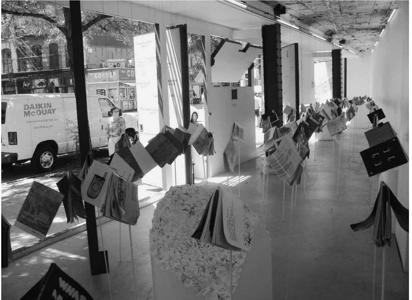
Figure 2. Acconci Studio. The Storefront for Art and Architecture , New York, 1993. Post-2008 reconstruction (Photo: A. Forster).

architectural program.” 30 Archigram’s science-fiction-like conjectural drawings and collages, far from being propaganda for positivistic technocratic utopias (in the mode of Le Corbusier or brutalism) were a collision with the future where technology served to create a new ecosystem of the built that questioned the very grounds of the discipline and conjectured buildings that were not fixed objects or monuments, but rather might move, or be evolved by their users, or disappear altogether. Archigram’s was a polemic practice in which a light-footed tuning to the logic of particular technologies became a device or a gambit for upsetting the kind of architecture that technology is habitually geared to maintain. They posited not a technology that keeps control but one that wanders according to a momentary logic of use—a Trojan horse in the house of techno-culture. Just as Acconci suggests that words might become “fact” and wander from the page into the city as a “continuation of poetry by other