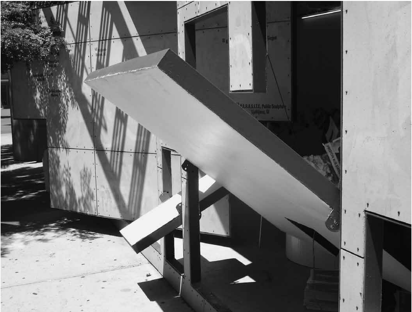
Figure 3. Acconci Studio. The Storefront for Art and Architecture , New York, 1993. Post-2008 reconstruction.

a spectacular proposal for a kind of updated Crystal Palace in which spectators would lose their observer/audience status and participate in a delirious range of diversions concocted through cybernetic and physical systems in a completely re-configurable building interior. In 1971 the Seventh Congress of the International Council of Societies of Industrial Design (ICSID) took place in Eivissa (Ibiza), Spain. Alongside the formal proceedings was a parallel series of encounters which was “not just an open congress where professionals and students could meet and debate; it was a point of convergence between design and the most experimental forms of art and architecture at the time in Spain.” 31 Among these was Instant City , conceived by Carlos Ferrater and Fernando Bendito, a massive modular inflatable village made of plastic, which was home to a social experiment involving collective design, meetings, dinners, and other events.