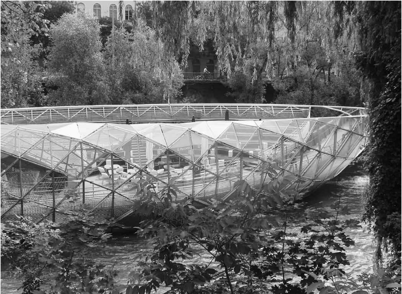
Figure 7. Acconci Studio. Mur Island , Graz, Austria, 2003.

preoccupied with the visual atmospherics of sensorial experience (beauty?), Acconci seeks to articulate places of spatial seepage and discomfort (impurity?). The sensitivity to public space as event (or parade) aligns Acconci Studio clearly with discussions pertinent to the field of landscape architecture. If architecture needs to be resisted, perforated, even collapsed, it is in order to have a conversation with landscape as built public place: “I think building should melt into landscapes, and landscapes can maybe develop into buildings... I did start thinking of public space and of architecture as, let’s walk into, across the monument. Let’s bring the monument back to the ground we’re standing on.” 36