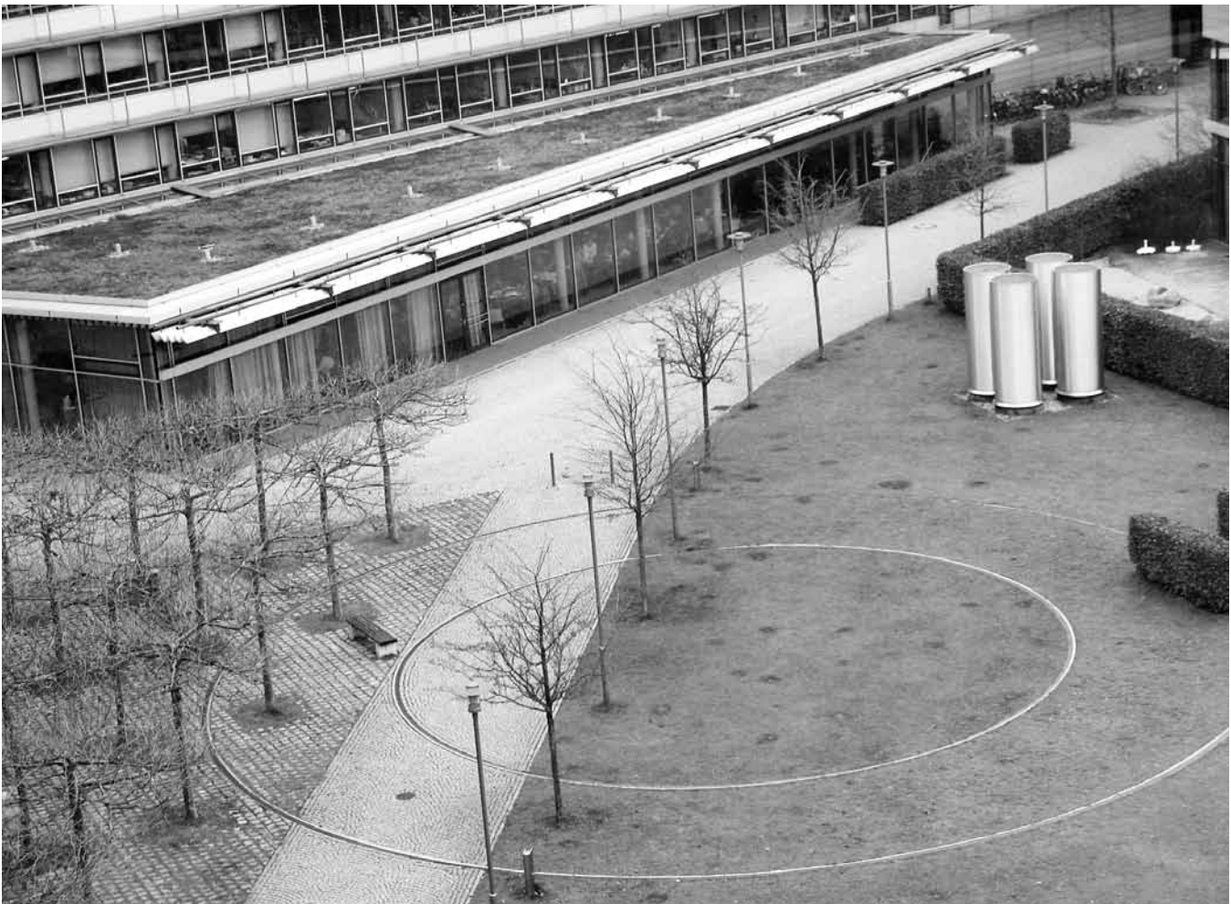
Figure 5. Acconci Studio. Courtyard in the Wind , Munich, Germany, 1997. Tower, turbine and courtyard.

The Storefront for Art and Architecture , designed in 1993 in collaboration with architect Steven Holl, animates the very facade that defines a building from the outside or a room from the inside, taking this basic boundary of place as precisely the thing to be brought into play, and once again literally flipping the public into the private (figs. 2 and 3). It recalls the slapstick rotating walls in Buster Keaton's famous parody of building, One Week (1920), in which Keaton builds a pre-fab house, but completely mis-builds it, having lost the instructions. He opens a door and it has the sink attached to it, now on the outside of the house. It is a film of gags based on displacement and physical discomfort. Storefront is the beginning of a formal strategy (hinted at in House up the Building and Park up the Building ) that continues through much later work, where floors and walls turn into seats and tables, where gardens go vertical, ceilings become ground, where paths wander off-axis, and civic space is floated offshore. This