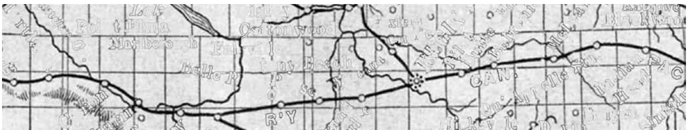
Unmapping Assiniboia: Without Words , digital sketch detail, 2014

Unmapping Assiniboia , currently in process, is a series of cartographic pieces that focus on structures of colonial claiming. Working from archival settlement maps, I draw, reproduce, and then erase the colonial tracks, digging out the grid, the railways, and the names. This is a process, a ritual of undoing. The pieces show the scars, the detritus of removal, but present a possible decolonized land.