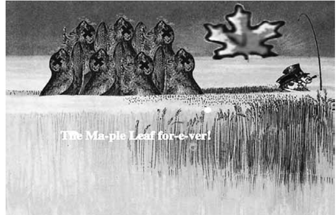
An audience sing-along video animation that appropriates and subverts still images from early colonial Canadian immigration advertising.

I am currently shaping three bodies of this work. My animated video Leaf Forever is made from still images found in a 1903 promotional brochure titled Canada: The Granary of the World . 1 By reactivating and reframing this material over one hundred years after it was made, I interrogate and tease how colonial ideologies slip into the present. The soundtrack to my video is a