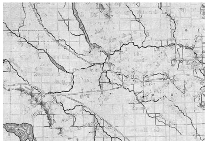
Unmapping Assiniboia: Without Words , digital sketch detail, 2014

Settler recruitment campaigns convincingly demonstrate that people are moved through creative strategies, through words and pictures, inducements and appeals. It took these diverse approaches to construct settler imaginaries, and it requires wide-ranging and creative strategies to disrupt them. Practice-based research creation is ideally suited to engage this ground.