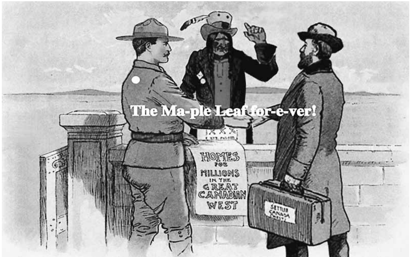
Video still, Leaf Forever , 4'38" 2012

Also in process is my performance work, Unsettling , based on the vermillion-coloured horse-drawn exhibition wagons used by Canadian land agents working farm to farm and door to door, recruiting settlers one at a time. A vermillion costume containing and displaying static and time-based media, Unsettling appropriates the capital in the personal touch. Colonial recruiters worked face to face and I do too, as I invite viewers to hunt through my clothing for small video projections and various other samples of colonial booty. This offers a close physical relationship between the viewer, the source material, and the appropriator/subverter/maker/performer—me. The small and intimate operation of Unsettling is crafted to assert that it is not only possible, but also necessary , to imagine decolonization in personal, tiny, but doable ways.