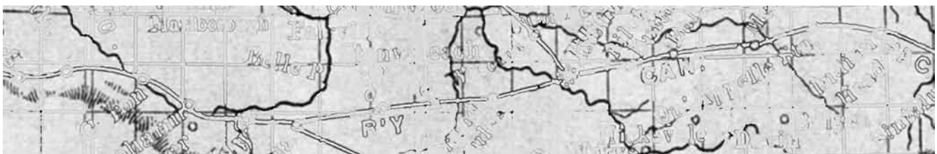
Unmapping Assiniboia: Erasure , digital sketch detail, 2014