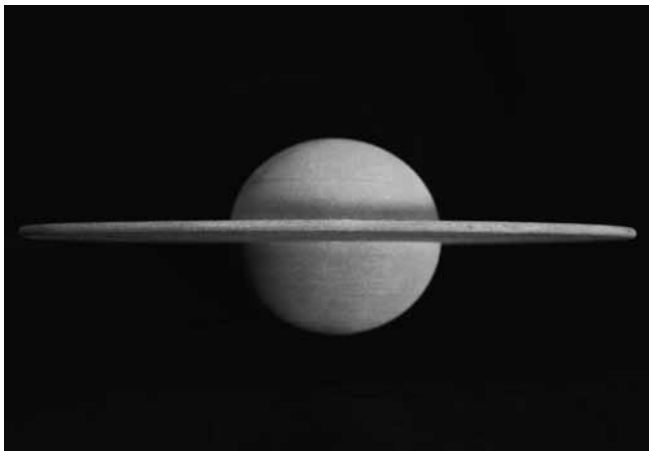
ABOVE: 3d printed plaster model of the planet from CAD file. 7.62cm sphere, 22.23cm ring tips (to G-ring). 2014. TOP: Imaging Saturn (inverted), 11 May 2012.

I have become an amateur astronomer within a professional and scholarly art practice that aggravates boundaries between expert and amateur, work and hobby, leisure and productivity. At the core of the project is an ongoing collection process based on the capture of at least one image of Saturn for each year of its orbit around the sun: a 29.42 year-long cycle. I have so far recorded images for the first four (Earth) years of the project, which started in 2011 and will run until 2040. This component of the project has challenged me to broaden my base of knowledge in the sciences of photography, digital imaging, optics, and astronomy.