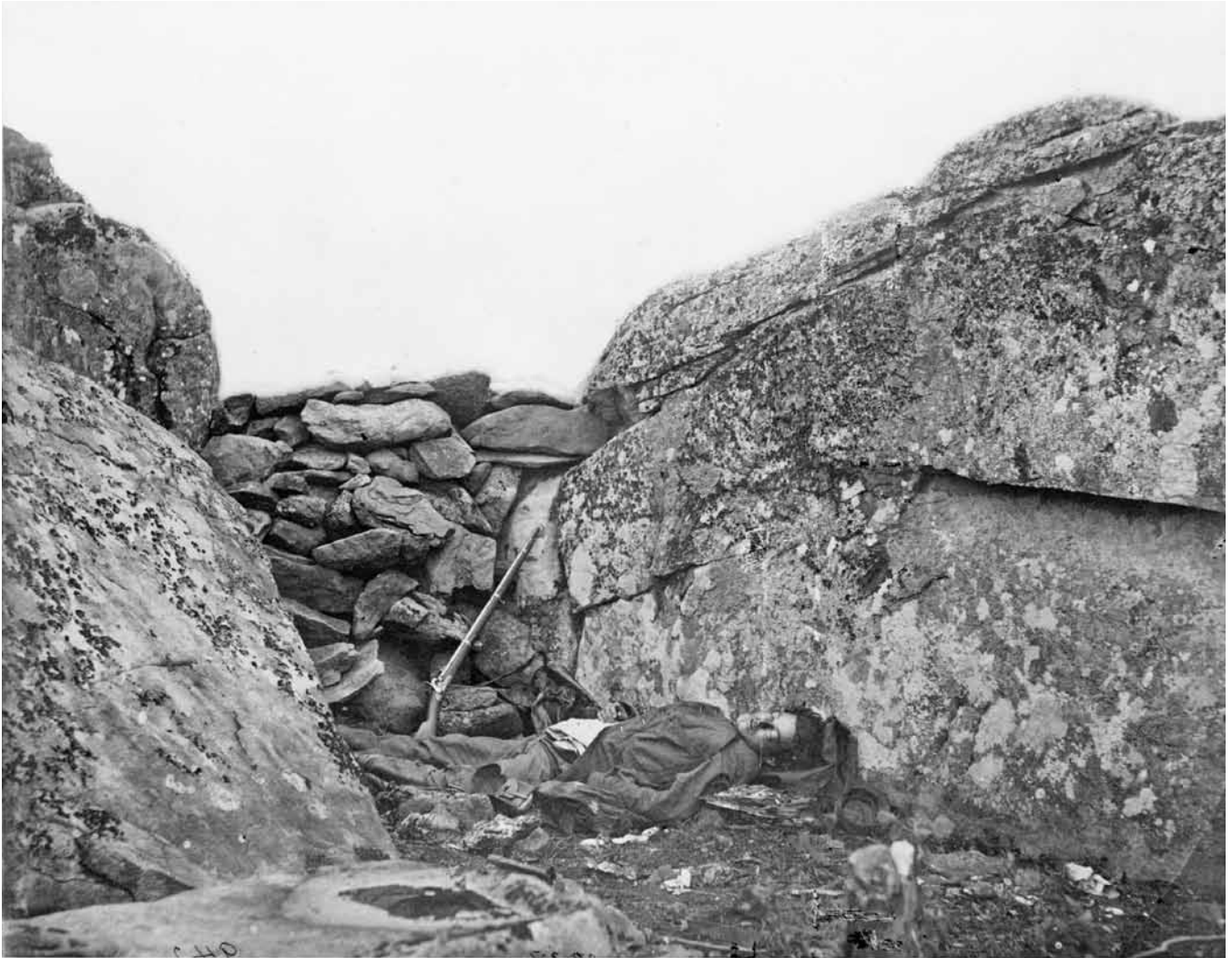
Figure 5. Alexander Gardner, The Home of a Rebel Sharpshooter, Gettysburg, 1863.

of nineteenth-century Prussian historian Leopold von Ranke. Ranke is credited with establishing a school of history with a large following. He insisted on the need for studying primary sources critically, taking into account all details, and arriving at a synthesis from these original facts. 33 For Ranke, there is an emphasis on the ideals of objectivity and the subordination of the historian to the “truth” of his or her materials. 34 Ranke’s scholarship roughly coincided with the discovery of photographic technologies and the introduction of new archival classification. The rhetoric surrounding photographs, archival records, and Ranke’s methodology all made similar demands on the reliability and unmediated nature of their evidence as accurate representations of reality.