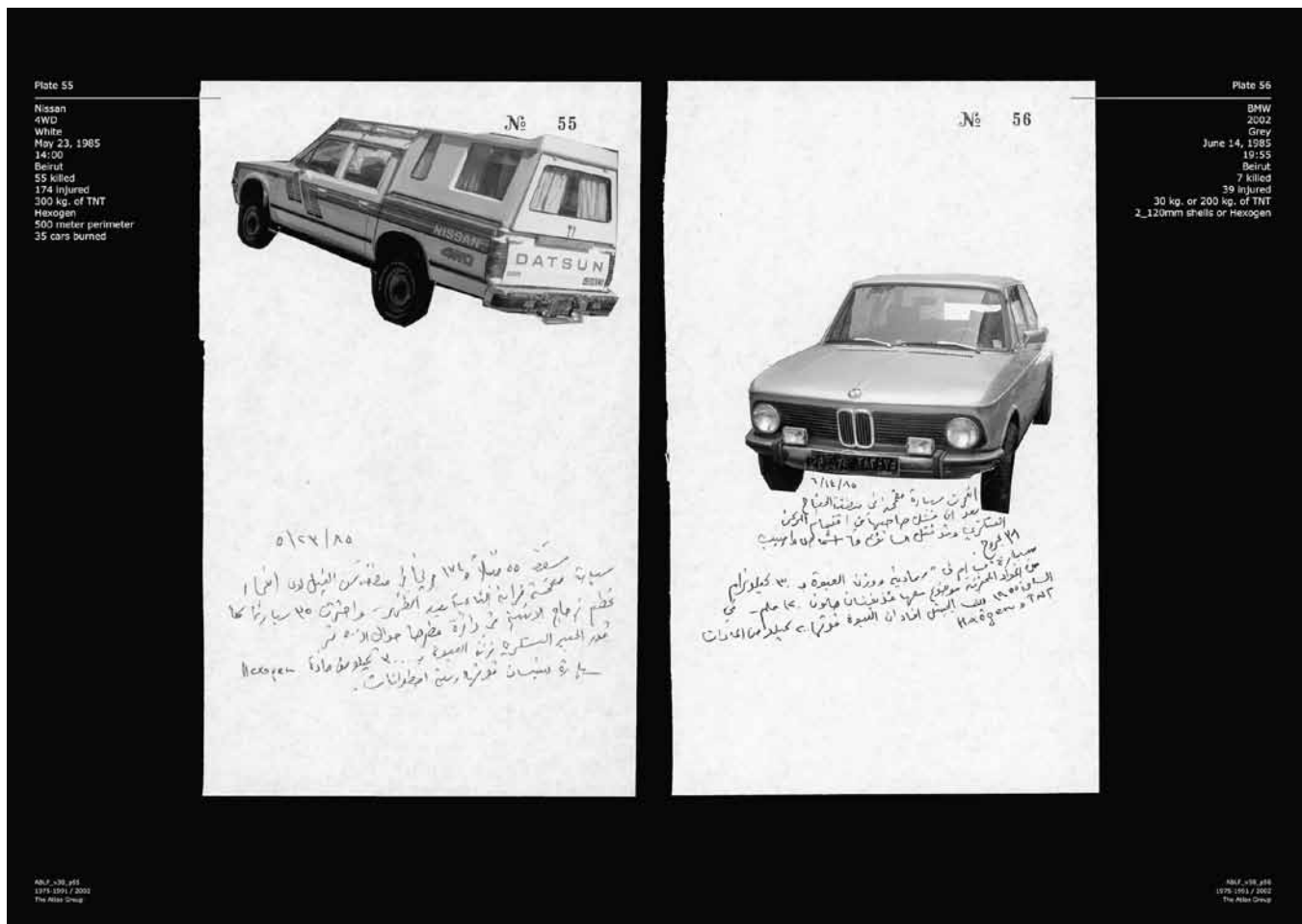
Figure 2. Walid Raad, Notebook 38, Already Been in a Lake on Fire , plates 55 and 56, 1991/2001, from the Fakhouri file, Atlas Group Project .

Furthermore, the accompanying statistics “speak” to a documentary discourse of facts. The photograph acts as a stand-in for both the exploded car and its facticity. It works as a sort of quasi-truth where the statistical data of a real exploded car bomb are combined with a photograph of a stand-in copy. This becomes a double substitution: a photograph of a substituted car and the history of the Lebanese wars replaced by the “facticity” of an exploded car. Despite the fact that this document is about a car bomb, there is no depiction of the explosion, of death, of blood, or of any trace of the trauma of war. A question arises: how can statistics accurately represent a graphically violent act? The ambiguous veracity of the notebook implies that while photographs and statistics are believed to represent objective facts, their supposed neutrality is often notoriously easy to manipulate to reflect different points of view.