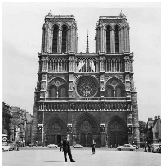
Figure 1. Walid Raad, Civilizationally, We Do Not Dig Holes To Bury Ourselves, plate 924, 1958–59/2003, from the Fakhouri file, Atlas Group Project.

I will focus here on the Fakhouri file, which is available on the Atlas Group archive website and is, together with all its notebooks and other contents, a product of Raad's imagination, as the artist explains in his lectures (but does not make explicit on the website). While the file and the archive are fictitious, its contents, comprising photographs and documents, give it a faithful resemblance to an actual archive and make it almost indistinguishable from the real thing. In the file, the fictitious Dr. Fakhouri is presented as "the foremost historian of the Lebanese wars" until his death in 1993. The file continues, "At