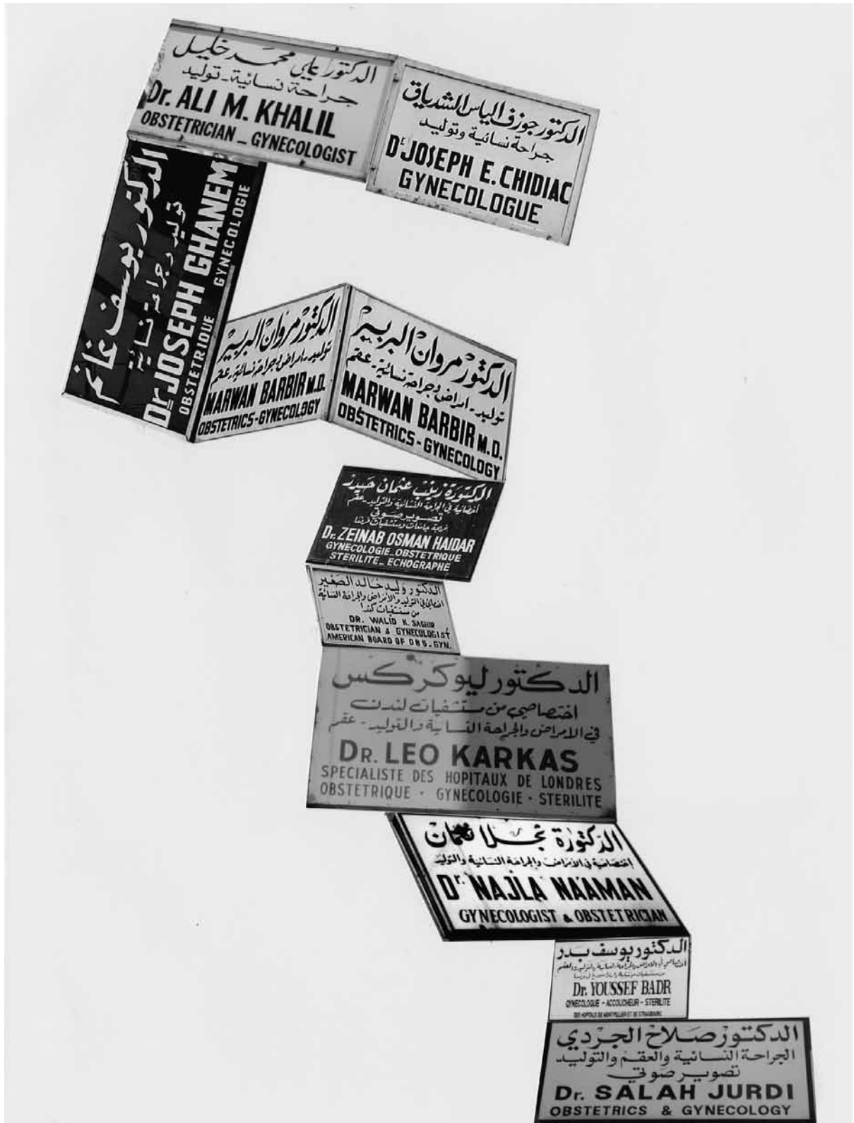
Figure 3. Walid Raad, Notebook 57, Livre d'or, plate 7, 1993, from the Fakhouri file, Atlas Group Project.